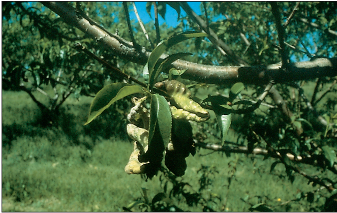
Figure 3. Peach leaf curl.