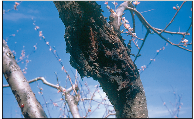
Figure 4. Peach canker.

Peach trees should be watered during dry periods in the summer. The period of final swell, the last few weeks before harvest, is a critical time for irrigation. If water is limited during this time, fruit size will be reduced. Generally, little irrigation is needed after October.