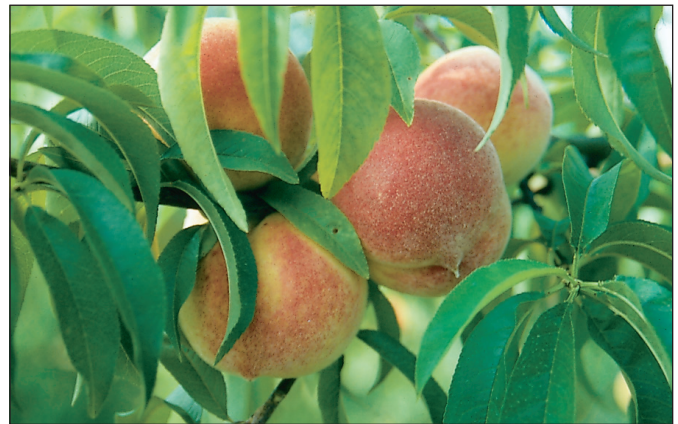
Figure 1. Redhaven peaches ripen in July in central Missouri.

Melting peaches are also classified as freestone or clingstone. Pits in freestone peaches are easily separated from the flesh. Clingstone peaches have nonreleasing flesh.