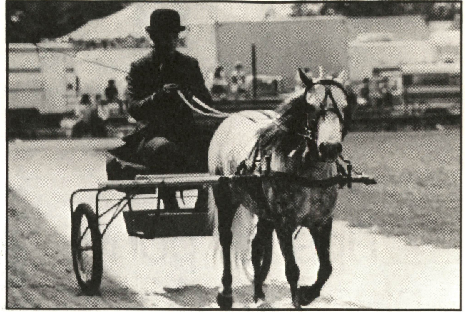
This well turned out pony and driver have the proper equipment, tack, and a well-mannered pony, but the whip position could be improved.

There are several options for outfitting your harness. A caveson or nose band is nice if your pony has a tendency to go with his mouth open or lets his tongue hang out. Another option you may choose for better control is a running martingale. The martingale should