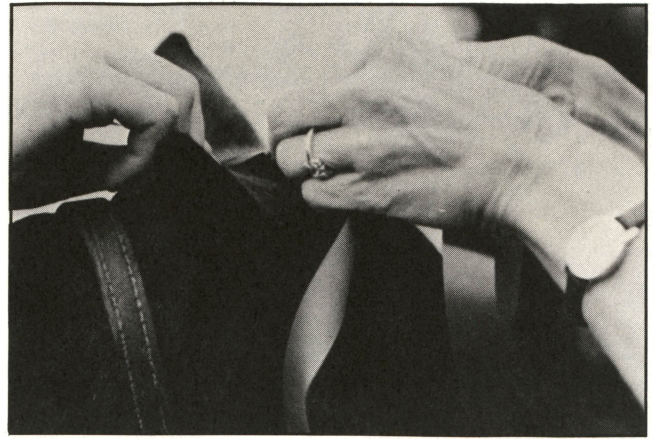
Braiding the forelock, washing, grooming and clipping make an attractive pony.

hicles is that they require greater driving skill to prevent them from overturning.