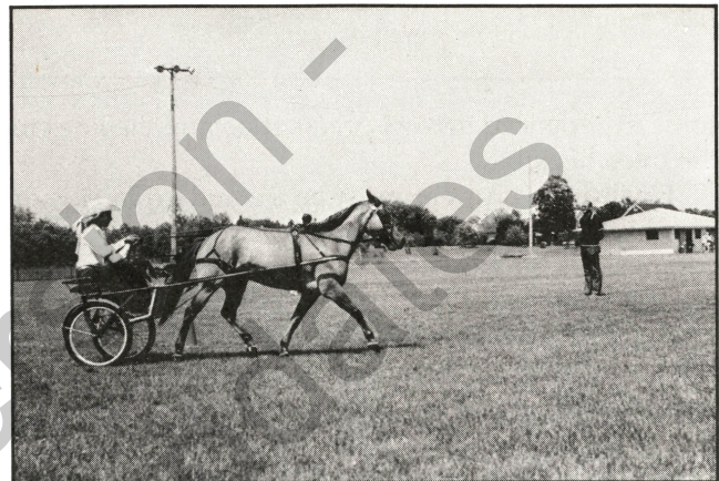
Before being shown, the pony should be well trained to walk, jog, extend the trot, and stand.

Besides surface quality, be aware of objects just