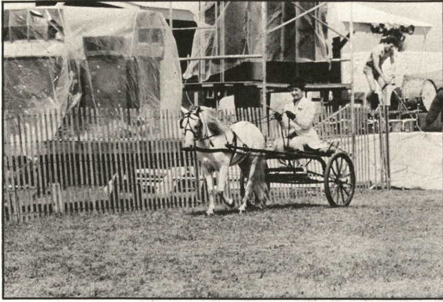
Whenever possible, practice in the show ring before showing in it.

some experienced drivers prefer attaching the lines to the overcheck bit.