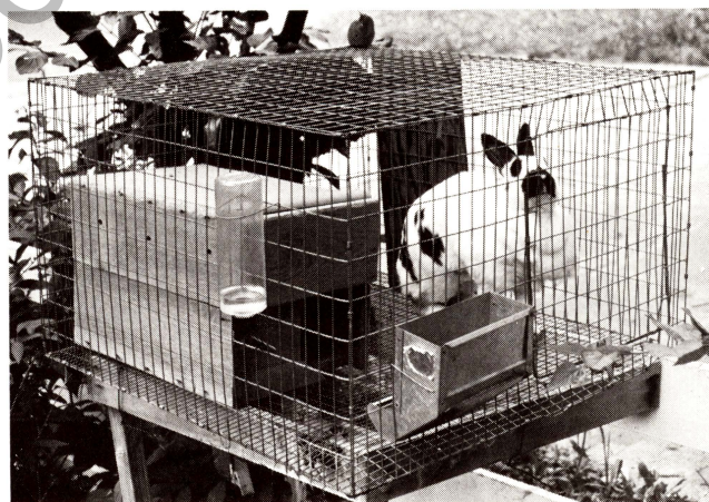
Figure 1. Wire rabbit cage is equipped with water bottle and hopper feeder.

Provide rabbits and small rodents with fresh, clean water from a sipper tube water bottle or a gravity-fed watering