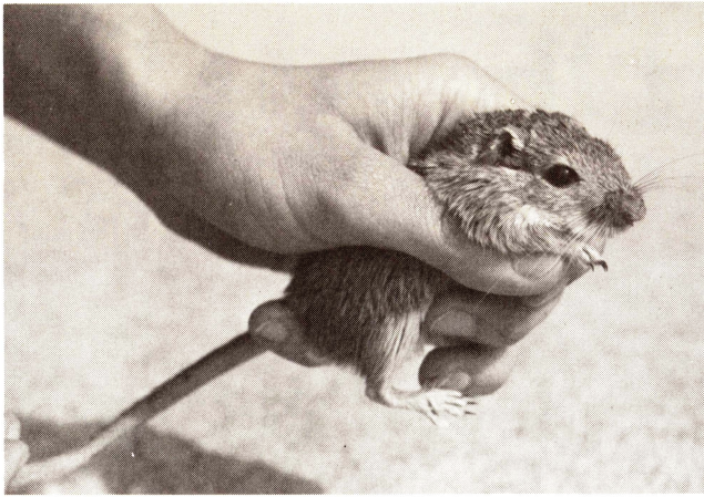
Figure 2. This shows proper restraint for a gerbil.

housed outdoors. Soft bedding, such as wood chips or paper, is needed for small rodents to hide and nest. Rabbits should be housed on wire floors. Wood is a poor material for animal houses because it is susceptible to chewing and rot. If wood is used, it should be painted and not used on cage floors.