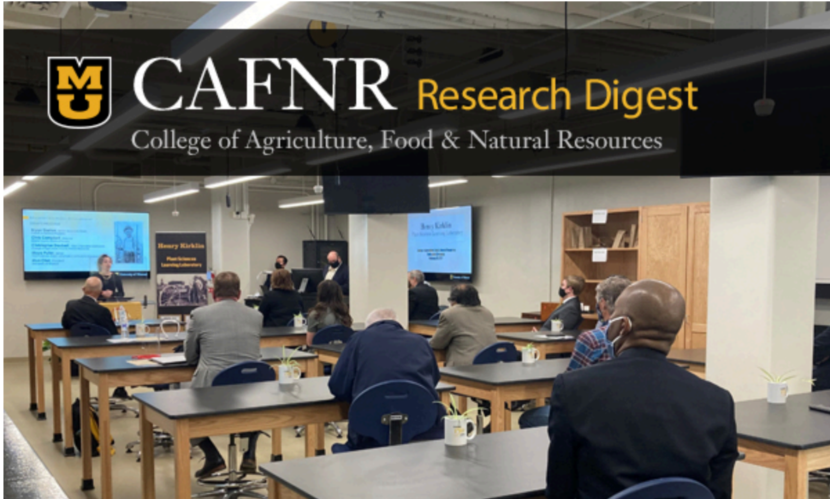
CAFNR Office of Research Newsletter // February 25, 2021 // 3(4)

Problem viewing this email? See it here »