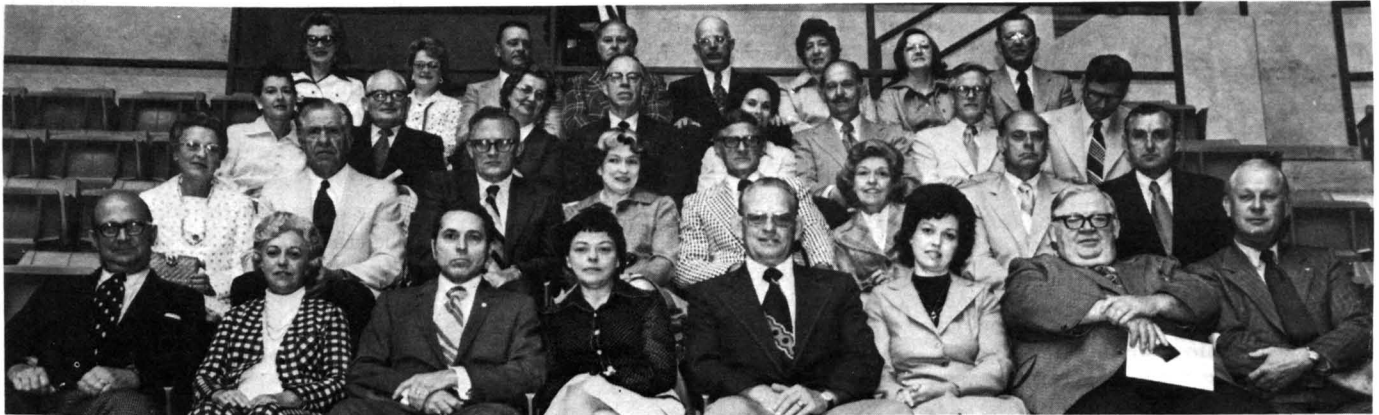
Class of 1950 Returns To Columbia