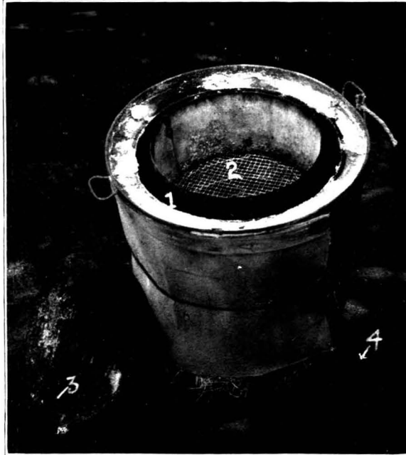
FIGURE I.—FREEZING APPARATUS FOR PLANTS THAT KILLED AT A TEMPERATURE NOT LOWER THAN -12^{\circ} TO -15^{\circ} C.