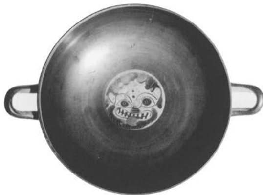
Fig. 1. Gorgoneion in tondo of black-figure cup. Attic, end of sixth century B.C.E., pottery. Museum of Art and Archaeology, acc. no. 57.4.

Several representations of the Gorgon's frontal face are in the Museum of Art and Archaeology at the University of Missouri. Gorgons were popular with Attic artists, and one example from the collection is illustrated in Figure 1. The Gorgon's head is painted in the tondo of the interior floor of a black-figure cup of the end of the sixth century B.C.E. 3 Battle scenes with Herakles