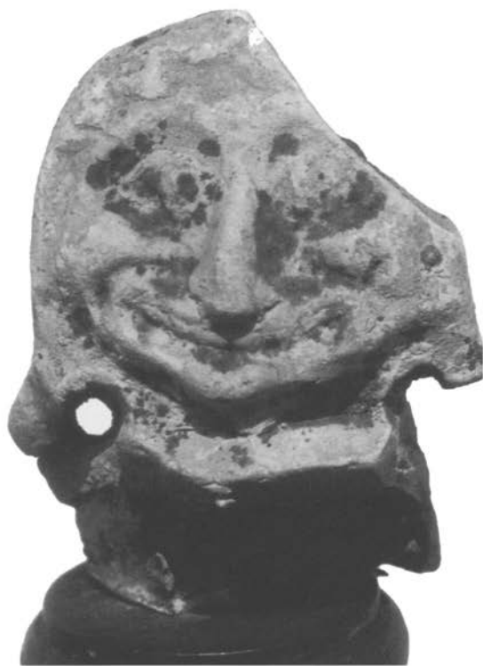
Fig. 5. Gorgoneion from a plastic vase. Istanbul Archaeological Museum, acc. no. 3195.

University of Missouri that analyzed trace substances from plastic vases came up with some interesting results from the Gorgon bird. 11 Traces of cedrol and cedrene were identified in the interior fabric of the vase. These are constituents of cedar oil, which is an insect repellent. Cedar wood is commonly used in modern times in chests to deter insects. One can speculate that the use of a Gorgon's head on a vase containing insect repellent might be an appropriate way to indicate the contents, the gorgoneion being seen as apotropaic in the sense that it is guarding against insects. 12