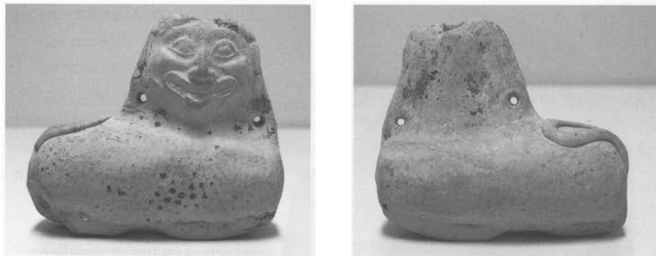
Fig. 3. "Gorgo-panther," front and back view. University of Sydney, Nicholson Museum NM 54.43.

While the placement of a gorgoneion on a bird's body in Corinthian plastic vases appears to be unique, a gorgoneion on an animal body is known. Figure 3 illustrates one of at least three preserved examples of what has been called a "gorgo-panther," in which the gorgoneion has been added to the body of a feline. 7 A comparison of the measurements of the Gorgon head with that of the Missouri "Gorgon bird" suggests that both heads came from the same mold and thus from the same workshop in Corinth that may have specialized in plastic vases. Another "Gorgo-panther" was on the Swiss market in 1967 (Fig. 4). 8 A third was on the New York market in 1987. 9 A gorgoneion from a Corinthian vase from Lindos is now in Istanbul (Fig. 5). 10 Again, the appearance of the head suggests that it came from the same mold as the Missouri example. Unfortunately, only the head of the vessel is preserved so we cannot know what sort of creature was represented.