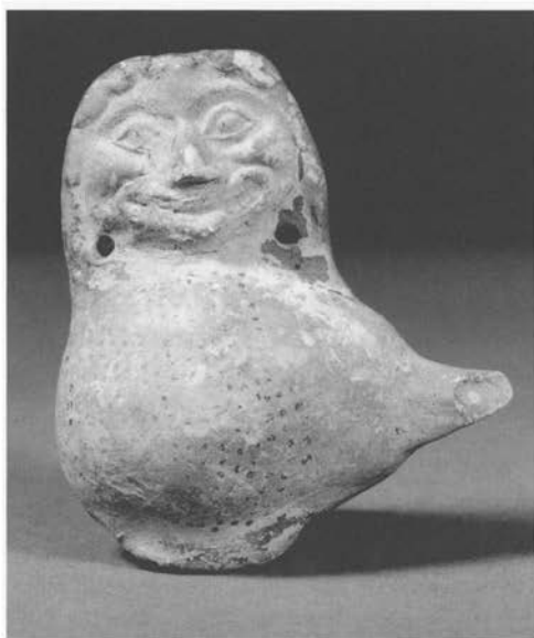
Fig. 2a. Gorgon bird, front view. Middle Corinthian, 595/590–570 B.C.E., pottery. Museum of Art and Archaeology, acc. no. 87.106.

attached to the body while other details such as the feet are handmade and attached. Two suspension holes are pierced through on either side of the neck, and the body is covered with black dots. There are remains of black decoration on the back of the head, and there are also traces of black on the Gorgon's face: on the forehead fringe, the eyebrows, and the center of the eyes. The vase is in fact a container with a filling hole in the head and belongs to a group of so-called plastic vases that were produced in Corinth and elsewhere in antiquity. 5 One of the characteristics of Corinthian plastic vases is the way they were manufactured, often combining different parts to make different representations. This is the case here, where the wheel-made bird body can change the vase's identification from a bird with a bird's head, to a siren with a woman's head, or to something else, a bird with the head of a Gorgon as seen in this example. 6