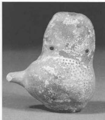
Fig. 2b. Gorgon bird, back view.