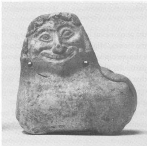
Fig. 4. "Gorgo-panther." After Kunstwerke der Antike, Münzen und Medaillen A.G., Auktion 34 (Basel, 1967) pl. 26.

These vases with Gorgon heads were containers. Such vases are generally believed to have contained perfumes or perfumed oils, and a research project at the