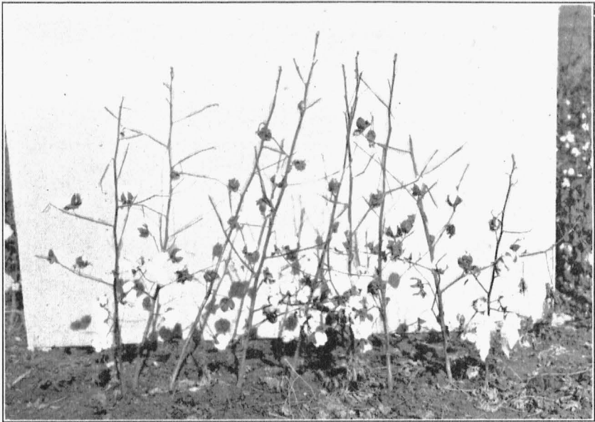
Fig. 2.—These nine closely spaced plants produced 60 well developed bolls.

Trice and Express gave the best yields on the Ozark upland soils. It may be noted, however, that all of these yields were low, as the result of a season that was very dry and unfavorable to all crops on most of the Ozark upland