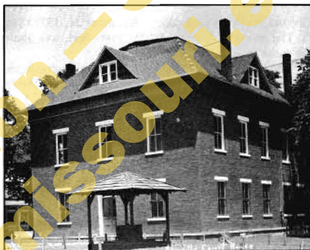
Fig. 1. McDonald County Courthouse. 1870-1978.