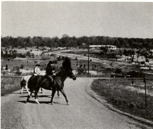
All riders in a line should turn on signal and cross the road together for safety's sake.

neously. This is done by riding single file, with the entire group turning onto the road at once. This type of crossing requires a long, straight stretch where oncoming motorists will be able to see the riders and slow down.