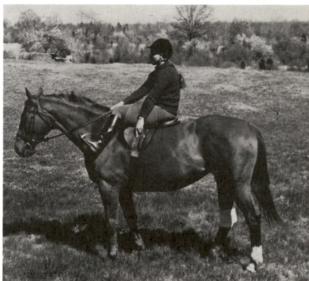
Don't ride with a loose cinch. Tighten it as needed in this manner.