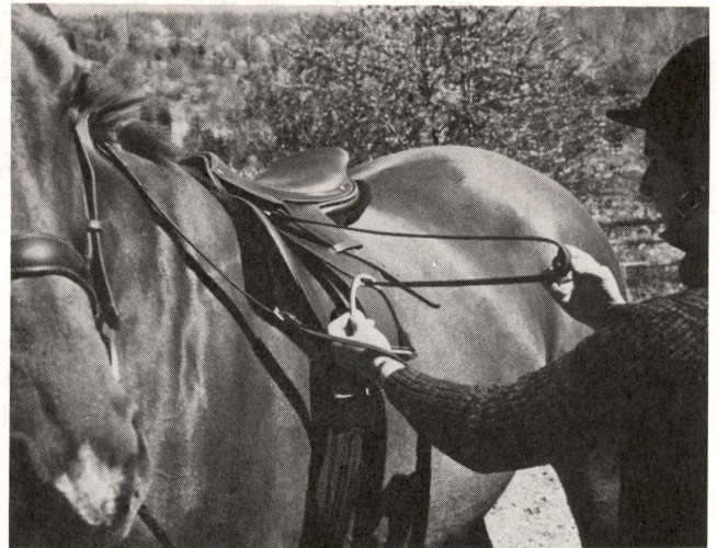
Dangling stirrup irons should be "run-up" when the rider dismounts.

As soon as you are dismounted, run the stirrups up unless you are planning to remount immediately. Dangling stirrup irons are dangerous. They annoy horses by bumping their sides, and can catch on objects, such as latches, fences or gates. If your horse is scratching or biting at flies, it may catch its hind foot or lower jaw in the iron!