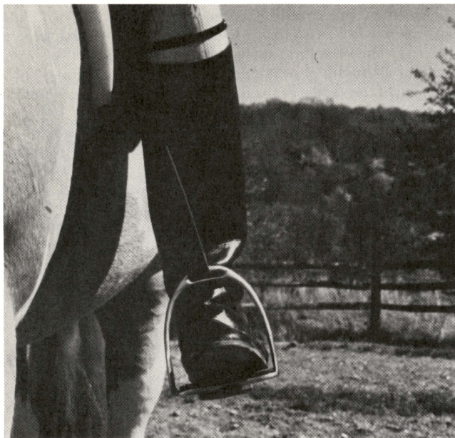
Stirrup irons should be one-half to three-fourths inch wider than the boot at the ball of the foot.

After you have ridden for a few minutes check the girth again. This may seem like needless repetition, but it is necessary on most horses. Check without dismounting, take the reins in your right hand, and with your foot still in the stirrup, swing your left leg up and onto the horse's shoulder. Reach down with your left hand, lift the saddle flap, and tighten the billet straps as needed.