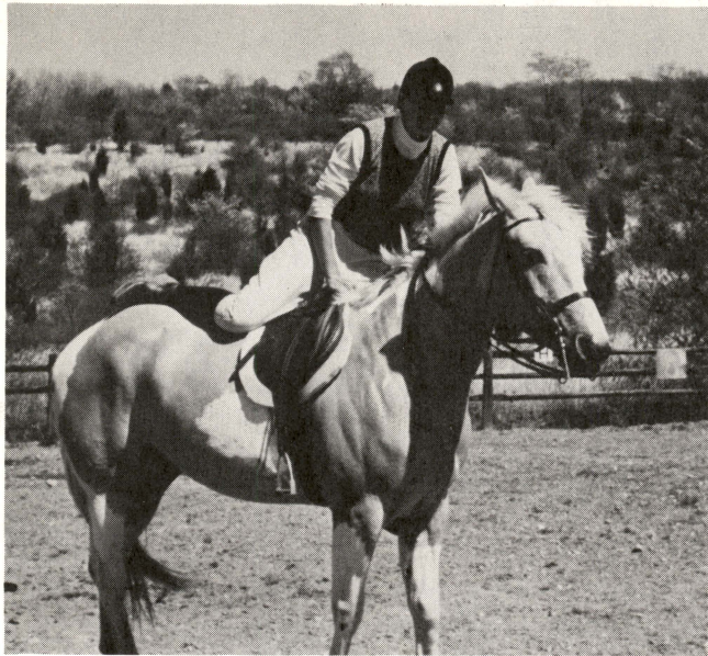
Dismounting is the reverse of mounting. Don't drag your leg on the horse's rump.

Don't attempt to mount a horse that is not standing quietly. A great deal of training is required to teach a horse to stand. If the horse begins to move, pull up sharply on the reins with your left hand. If you are quick and smooth about mounting, the whole procedure will be much safer and the horse will be less likely to move.