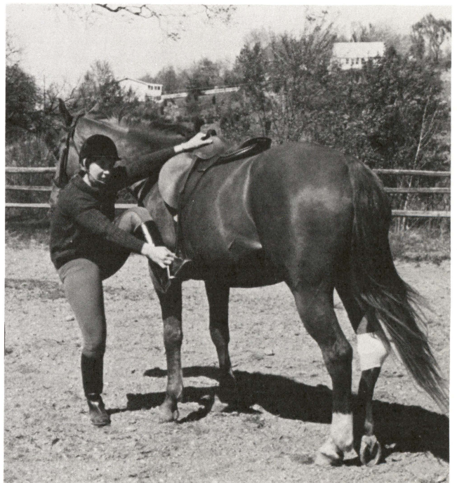
Safe position from which to mount. The left hand controls the reins as the rider prepares to mount.