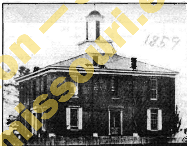
Fig. 1. Butler County Courthouse, 1858-1886.

The court authorized funds for the second courthouse from the sale of 10,000 acres of swampland (at not less than $1.00 per acre), which was the only source of income to finance such a project. Commissioners also had the option of trading swampland to the contractor as compensation. The court appointed three commissioners in April 1858 who were to furnish plans and superintend construction. After serving for some time, one commissioner resigned, and finally all three