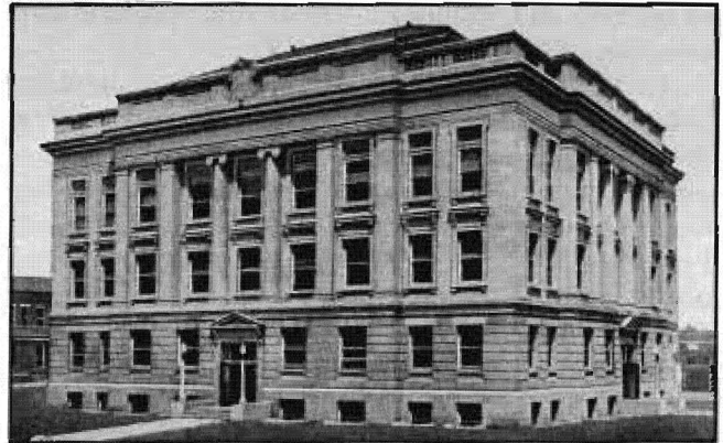
Fig. 4. Butler County Courthouse, 1927-. Architect: N.S. Spencer and Sons

The cornerstone ceremony was conducted June 26, 1928. The following May the courthouse was dedicated (Fig. 4). Final costs amounted to $265,000. There are four entries, all alike so as to show no partiality to any adjacent properties. The Circuit Court room on the third floor, which seats 300, had elevator service in the original plan. Butler County government continues to operate from this 20th century courthouse.