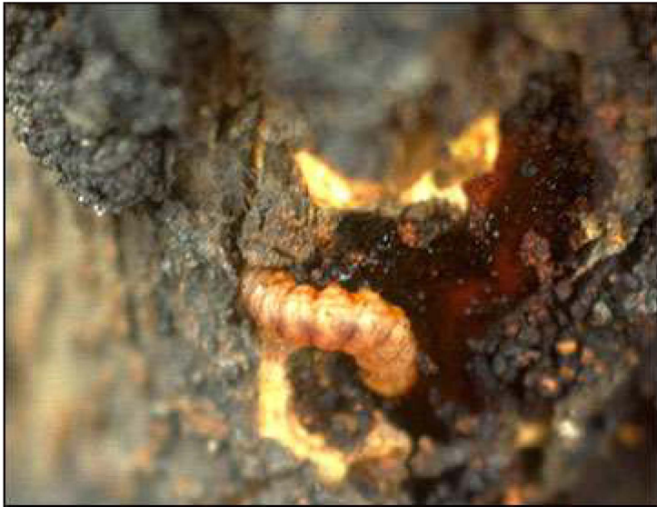
Figure 5 Larva of dogwood borer.