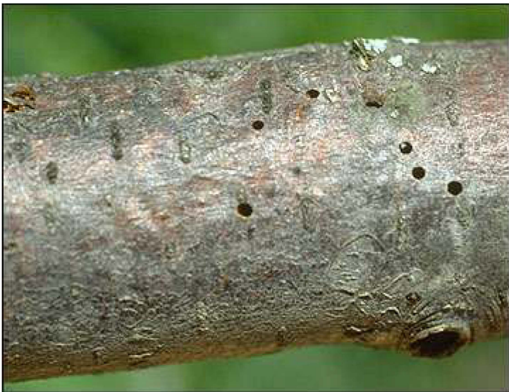
Figure 3 Emergence/exit holes of adult shothole borers.