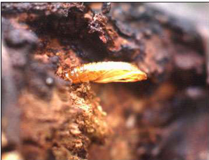
Figure 4 Pupal skin of lesser peachtree borer protruding from tunnel hole. Adults usually emerge in late April to early May.