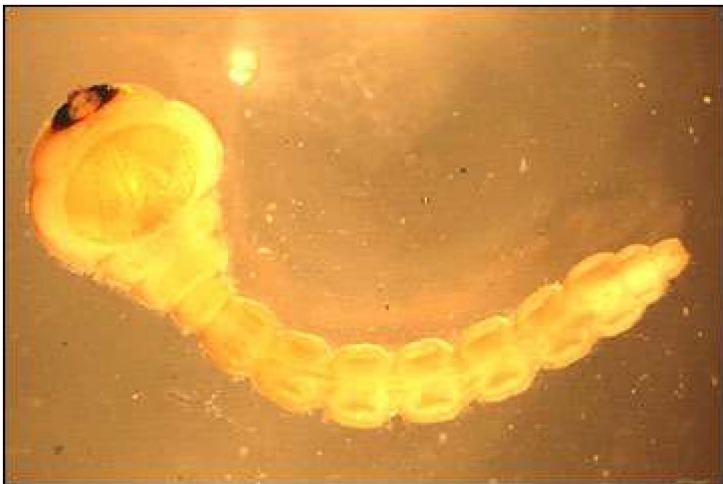
Figure 1 Larva of a flatheaded appletree borer.

Chrysobothris femorata (Olivier) — Coleoptera: Buprestidae