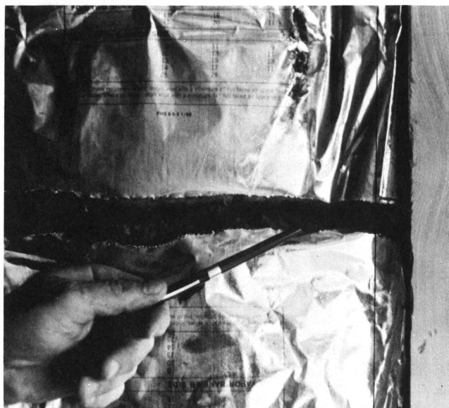
Figure 2. Poor workmanship during installation is a major problem with insulation in today's home. The poor fit shown here leaves an uninsulated area of the wall which the homeowner will probably never see, but which will add cost to every fuel bill.

Moisture does not need to be a problem in your home if you recognize it as a part of the home environment and manage it accordingly. Additional information on moisture problems and their control can be found in UMC Guides 1704, 1708 and 1709, available through your county University of Missouri Extension Center.