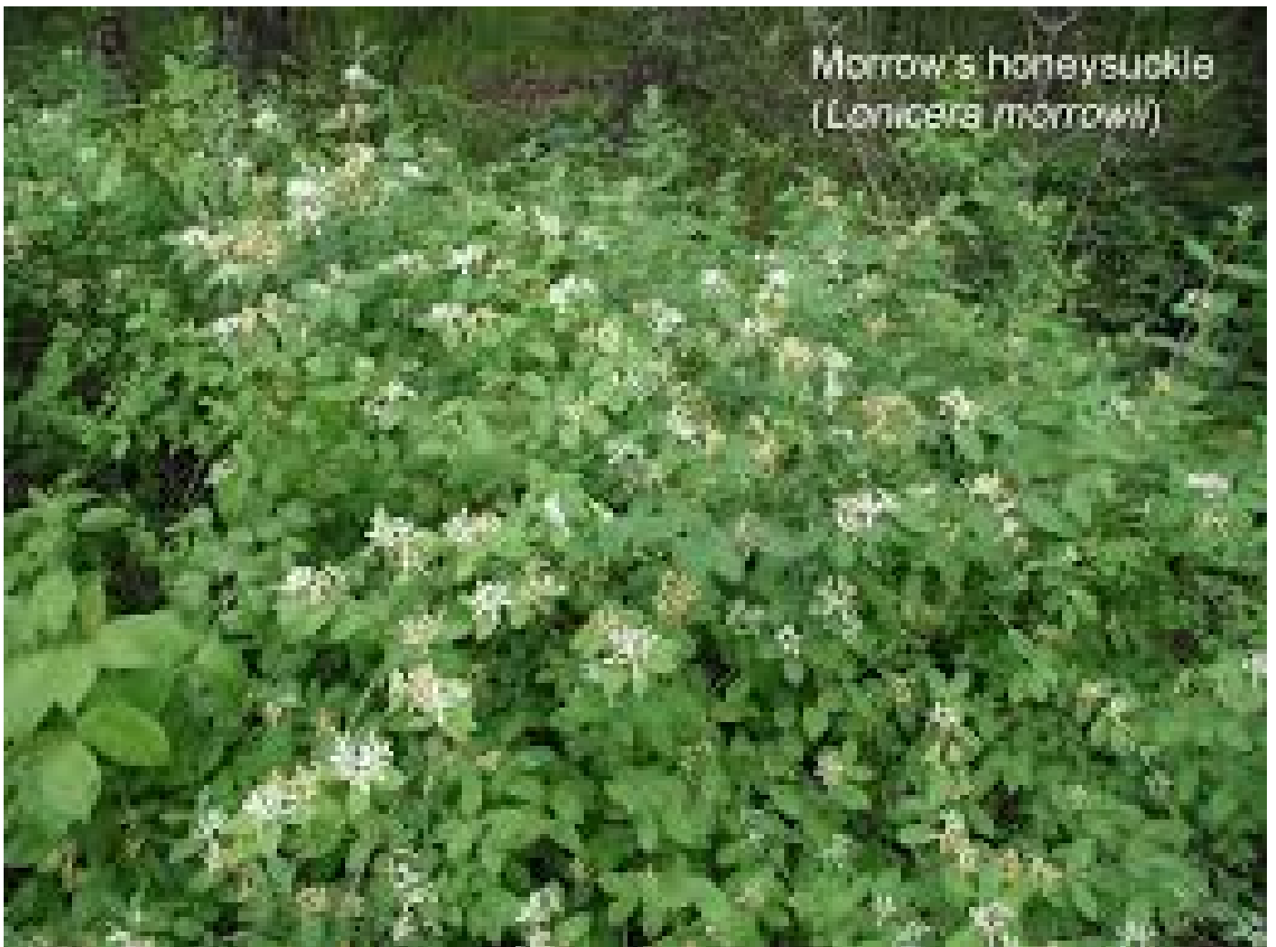
Morrow's honeysuckle ( Lonicera Morrowi )

Mizzou Advantage Writing Contest: 3rd Place