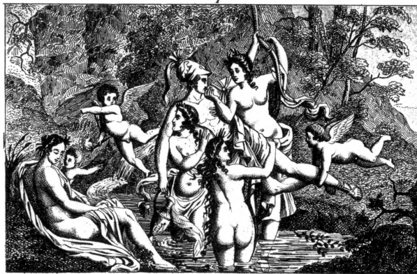
Hylas carried off by nymphs