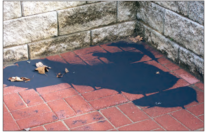
Figure 3. Large numbers of springtails may congregate outdoors in masses after rainfall or when the soil becomes extremely dry.

minimize moisture sources by repairing leaks, eliminating spills, insulating cold water pipes, and reducing humidity in infested areas.