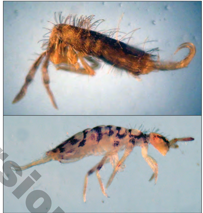
Figure 1. Two representative species of springtails.

Springtails occur in moist habitats almost everywhere except under water. Many species of springtails even live in the tidal zones of the seashore. Occasionally, large numbers of springtails congregate outdoors in masses as large as a softball. Often, these masses appear on a sidewalk, patio or concrete porch (Figure 3). Other species are called snow fleas because large groups of them will occasionally