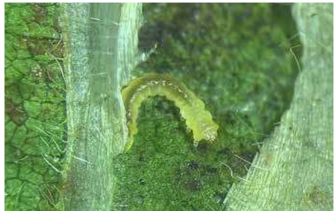
Figure 2. Larva of Macrosaccus morrisella on a soybean leaflet.