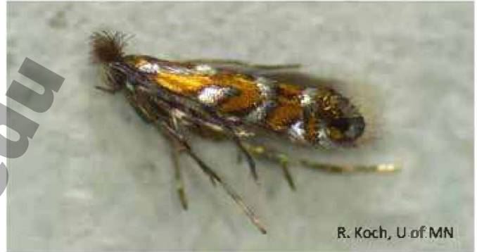
Figure 1. Adult Macrosaccus morrisella .

Macrosaccus morrisella adults are small moths (wingspan 6–7 mm) with orange, white, and gray-black wing markings (Figure 1). Eggs are deposited on the abaxial surface of leaves. Larvae (Figure 2) are white-colored when young, turn pale-green in color when more mature, and reach approximately 4.7 mm long. Early instar larvae are sap-feeding, causing serpentine mines, which then expand into whitish blotch-like mines on the abaxial side of the leaves. Late instar larvae are tissue-feeding, and the whitish blotch eventually becomes tentiform. Multiple larvae can be found in the same mine. The larvae pupate inside the tentiform mines. Macrosaccus morrisella undergoes five larval instars, and laboratory studies indicate an immature developmental period from egg to adult emergence of approximately 25 days at 25 °C (Figure 3).