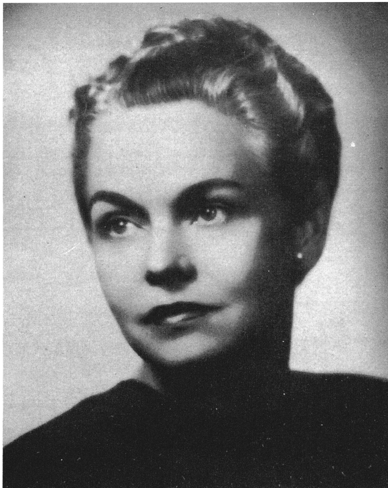
Oveta Culp Hobby