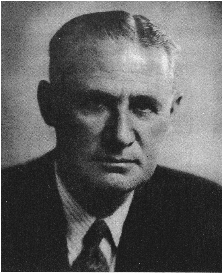
Arthur Hays Sulzberger