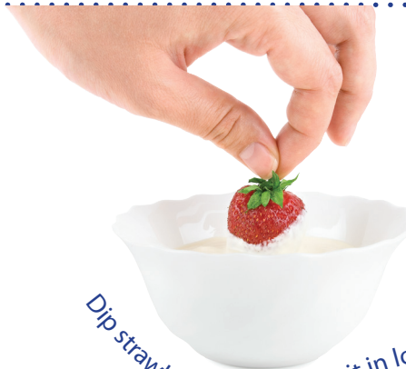
Dip strawberries or other fruit in low-fat yogurt.

What ideas for quick and easy snacks do you have?