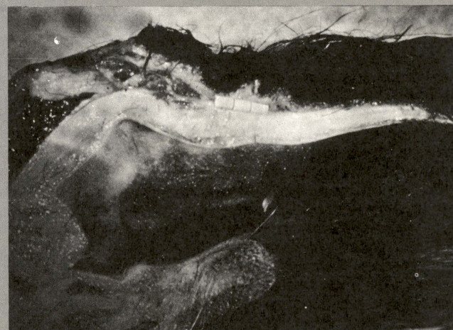
Implant pellets 1 inch from the cartilage ring beneath the skin.