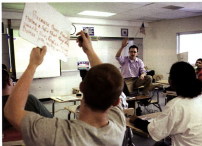
Higgins hosts "College Jeopardy" with a class of freshmen to familiarize them with college requirements. For Higgins, the earlier he can prepare students for the enrollment process, the better.

With a college diploma, the difference in earning potential is dramatic. According to the U.S. Census Bureau, workers ages 18 and older with a bachelor's degree earn an average annual salary of $51,206, compared with $27,915 for those without.