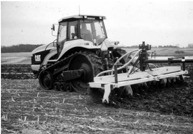
Figure 5. Tractor-drawn drag-hose incorporators and injectors are commonly owned by custom operators.