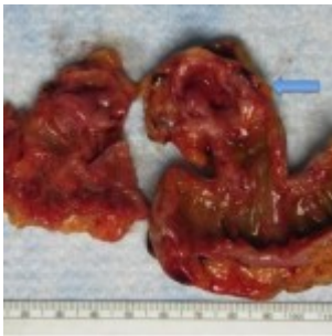
Figure C. Gross specimen