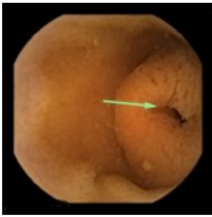
Figure A. Meckel's diverticulum on capsule endoscopy