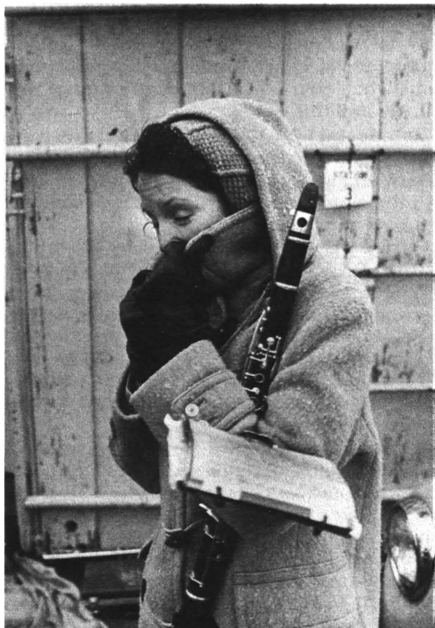
The snow won't stop rehearsal. Sometimes one may wish she had learned to play piano.