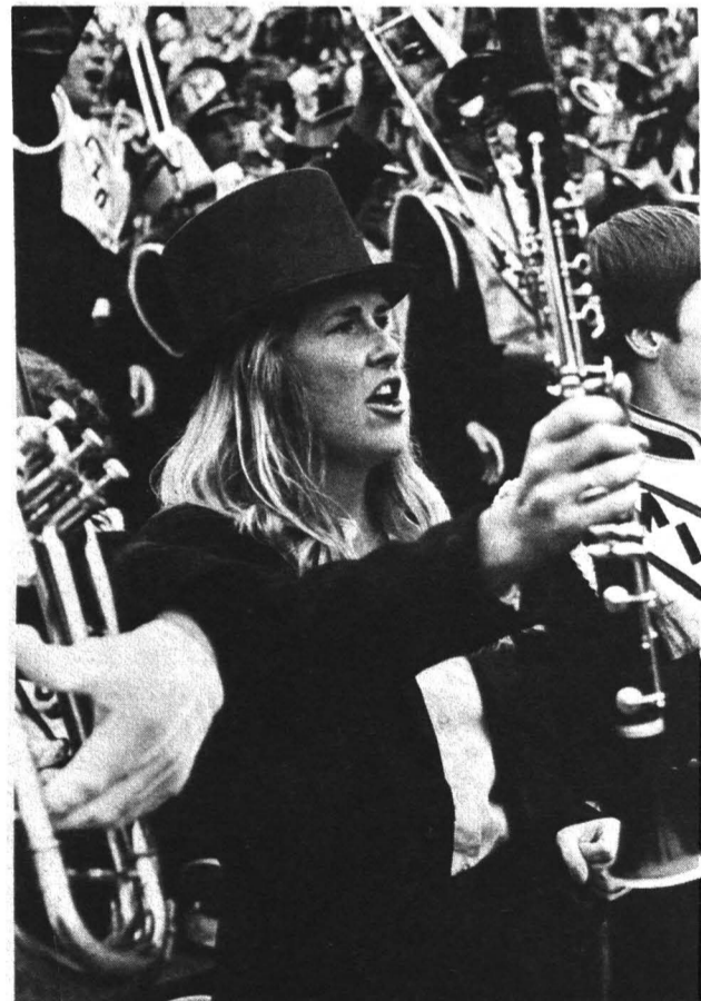
But Saturdays are worth the whole week's work. All this and England, too.