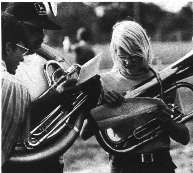
Where to run? The question keeps recurring with every new show.