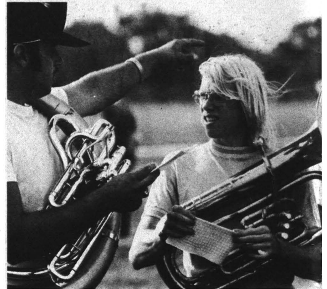
Honest men may differ when the map is not clear. Maybe to the left, huh?