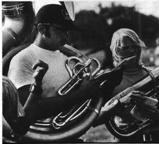
If you don't move soon, you'll get trampled. The others went that way.