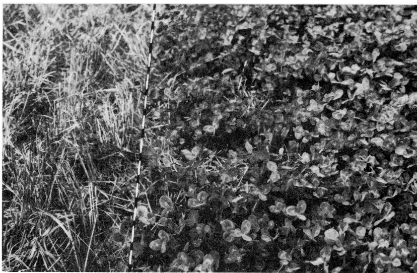
Fig. 4.—The right amount of lime spread on lime-hungry soils will help you grow better crops. Lime and fertilizer made the difference between good clover on the right and none on the left.

Lime cannot take the place of other plant nutrients. When lime increases crop yields, the need for other plant foods increases. Nitrogen, phosphorus or potassium, or a combination of one or more of these plant foods, may be needed in varying amounts in addition to the lime for most satisfactory returns. Wise use means it should be properly used in conjunction with other needed soil treatments as indicated by soil tests on samples taken to represent each different kind of soil in the field.