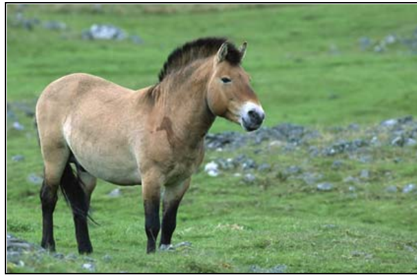
Figure 1. Przewalski's horse ( Equus przewalskii , also known as Mongolian ass, Asian wild horse, Mongolian wild horse, and takhi) is the last remaining true wild horse. Several reintroduced herds survive in Mongolia.

Originally domesticated 5,000 to 6,000 years ago, wild horse populations once roamed much of the Eurasian steppes (Petersen et al., 2013a, 2013b; Warmuth et al., 2011). E/SE Asian indigenous horses are repositories of valuable genetic diversity. Numerous traits have been exploited to develop many of the world's 500 unique breeds. Founding horse populations contained a wealth of genetic diversity. However, because of artificial selection and loss of most of the wild populations, this pool of diversity is disappearing (McCue et al., 2012),