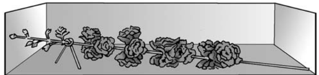
Figure 3. Provide support to dry spike flowers in a horizontal position.

Flowers with wire stems are dried facing upward, and the stems are bent or curled to lie parallel to the bottom and out of the way. Flowers on natural stems may be dried on their sides (Figure 3), as in the case of spike flowers such as larkspur or snapdragon, or upside down with stems protruding upward. Working the drying agent between the petals is difficult when flowers are placed facing downward. When placing flowers on their side, a brace is necessary to hold the stems so flowers on one side are not flattened.