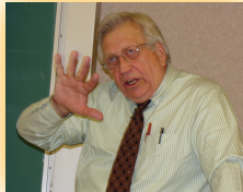
Wes Jackson urging more sustainable agricultural practices

Funding from Mizzou Advantage enabled us to bring nationally known scholars to campus to address topics related to food and society, establish personal and professional ties to MU faculty and students, and develop a network of scholars examining the social dimensions of food.