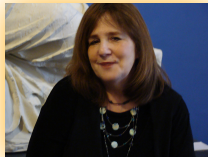
Susan Bordo discussing the media, gender, body image & eating problems