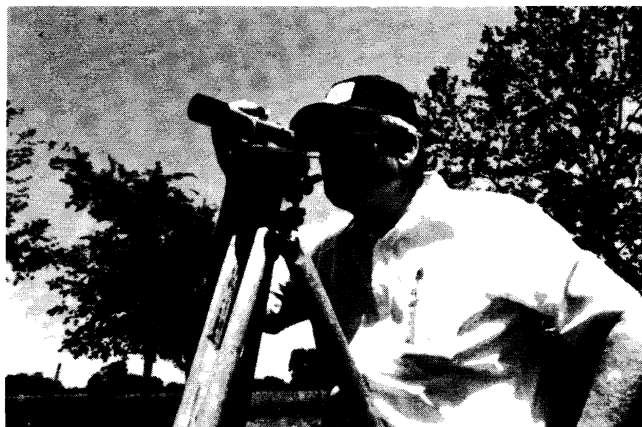
Consulting engineers provide technical services in designing livestock waste management systems.

Design criteria for animal waste management systems is found in DNR Manual 121, “Design