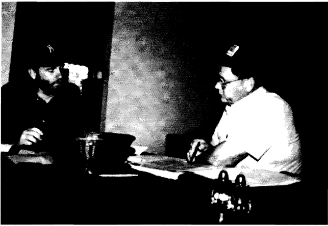
Good communication is essential in working with a consulting engineer.

tant for an animal waste management project design should: