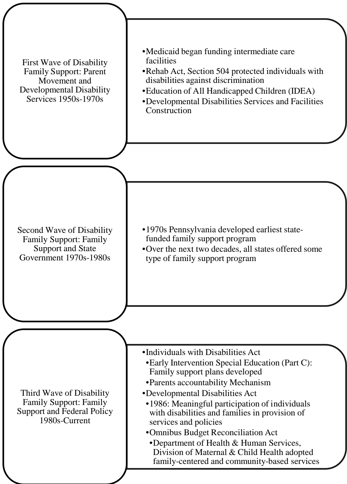
Figure 3: Progress of the Disability Family Support Policy