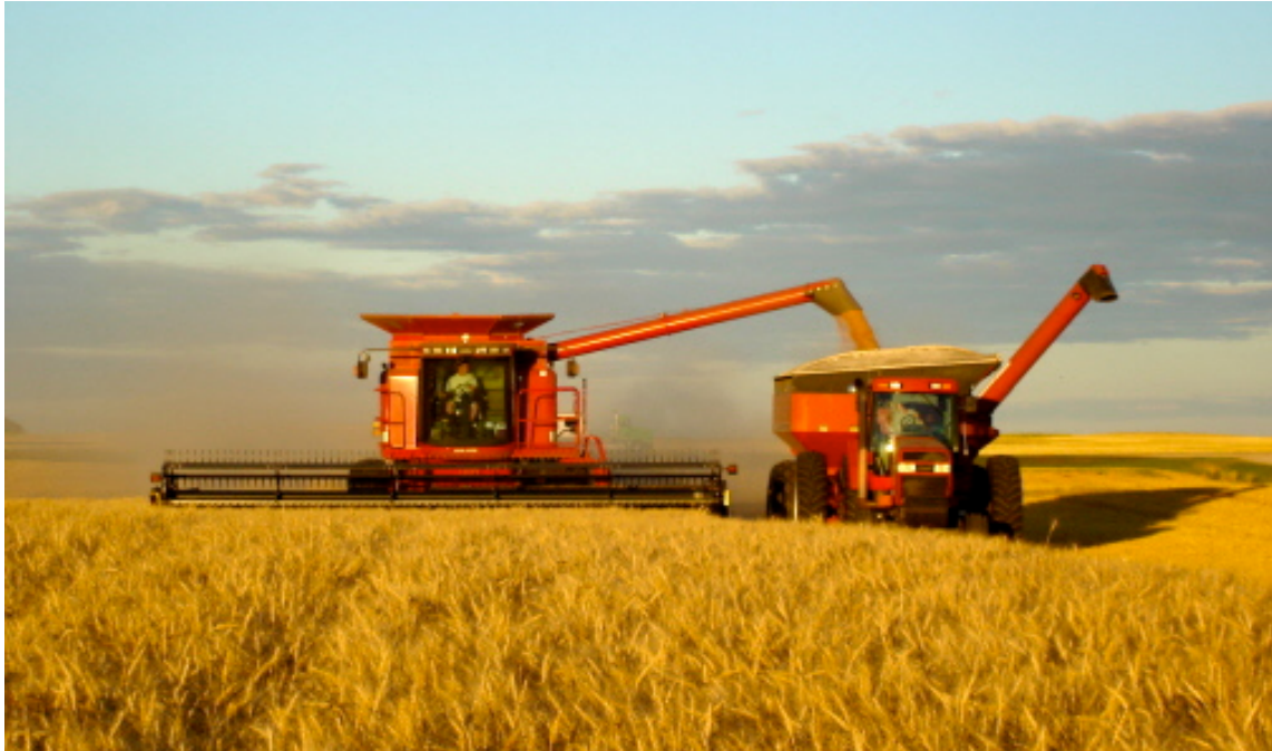
Wheat harvest on the Fransen Farm during 2005.