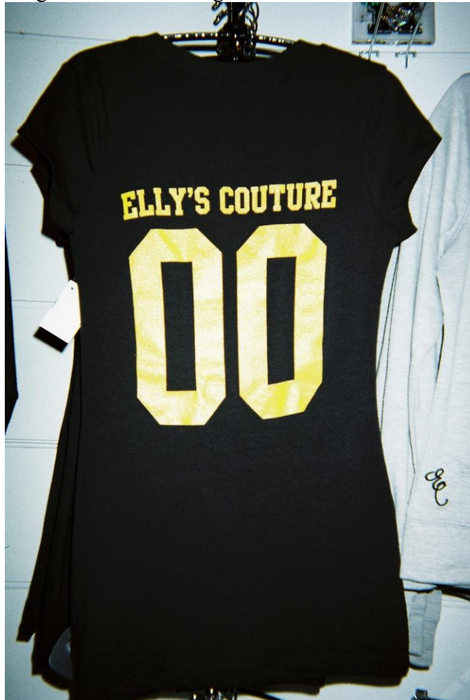
Figure 2.3. The owner of the college couture retail store created a t-shirt in the colors of the local University in town so customers could show their school spirit and also still shop at their favorite boutique.

The owner of the resale vintage store has been in business for over 10 years, and still identifies her success and passion being fueled by building strong relationships and being able to support her customers in whatever they are looking for.