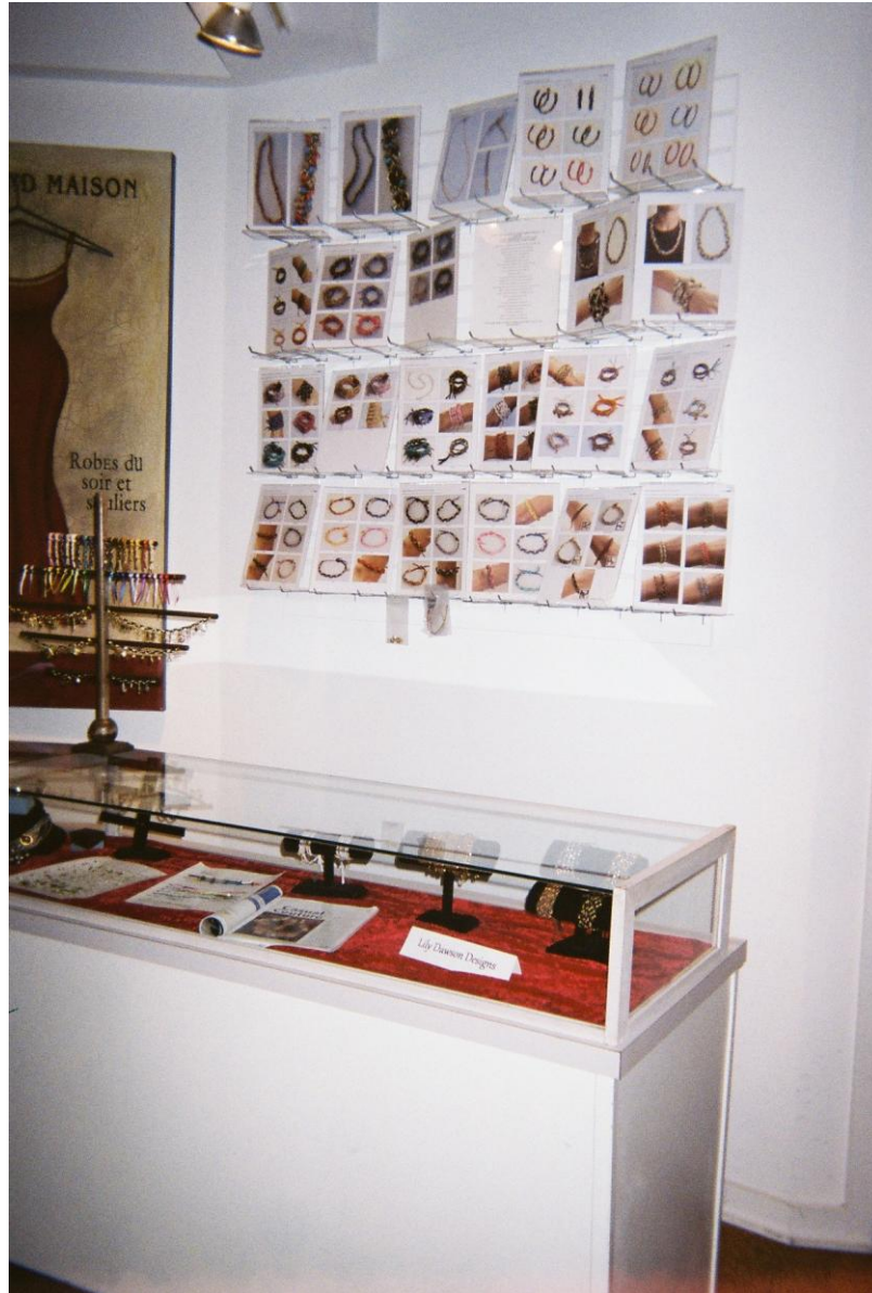
Figure 3.2. A display in the college couture store of jewelry that is created by a local vendor, supporting those within their community.

The owner from the fair trade retail store and the owner from the resale vintage store both participated in a local film festival that took place during data collection. It is common for businesses in the downtown area to decorate their stores or store windows in