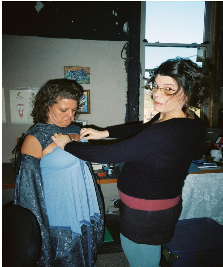
Figure 2.1. The owner of the dancewear manufacturer fitting a customer in a garment, making sure it is to her liking and will perform in the ways she needs it to for the purposes in which she will be wearing it.

The owner of the fair trade store talked about the importance of building relationships with customers, and realizing that was one of the missions of the business. She is able to build strong customer relationships through the interactions that her customers have with the volunteers that work in the store and can educate people and are