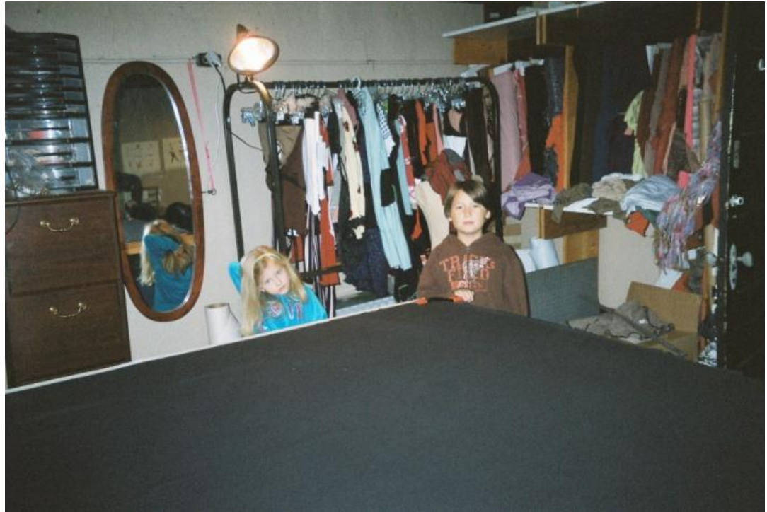
Figure 4.1. Flexibility in work. Child and friend of Case 2 owner hanging out in production studio.

The owner of the college couture retail store noted that she felt successful and had more flexibility in her schedule by being able to delegate tasks to her employees. Figure 4.2 shows an employee of this SME owner who is in charge of the window displays and describes flexibility through delegating tasks in this way: