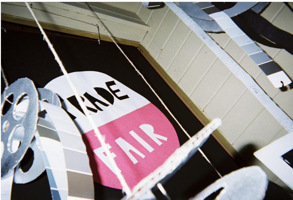
Figure 3.3. The owner from the fair trade company created a special window for her store during a local film festival to show her support for the downtown community.

The owner from the fair trade retail store also gets involved in the community through hosting events and seminars that spread the word about fair trade. Figure 3.4 is the first slide of a PowerPoint presentation that the owner uses when she speaks at these events. By being able to spread the word about fair trade and her store, this owner