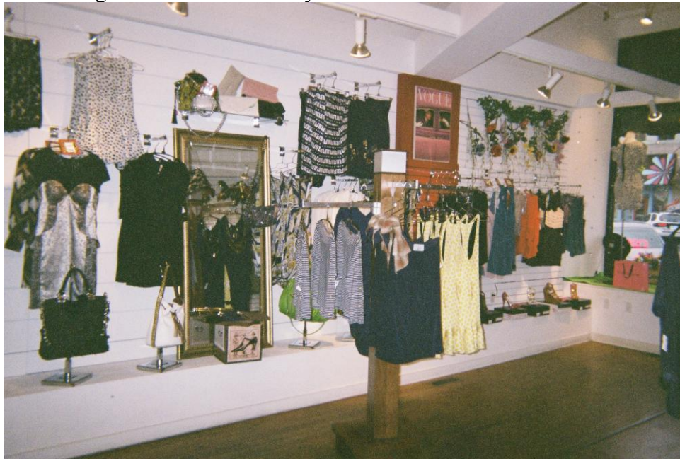
Figure 1.3. Purchasing the right amount of inventory during all seasons from the college couture retailer