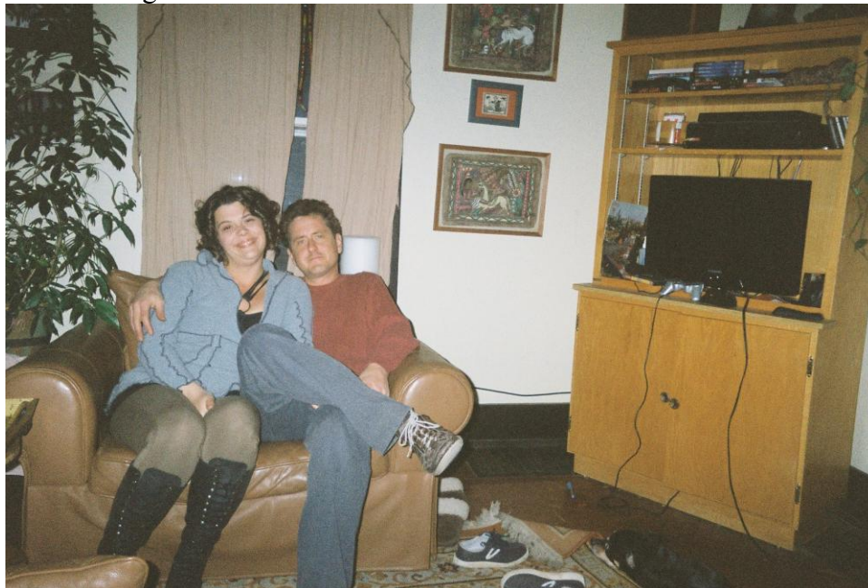
Figure 5.3. The owner of the dancewear manufacturing company lounging with her husband and making sure to spend quality time together amidst both being small business owners.