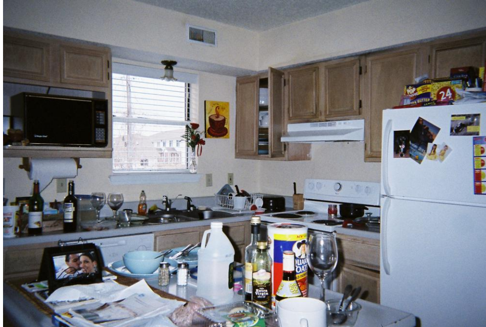
Figure 4.3. The dirty kitchen of the owner from the fair trade retail store. She describes understanding that sometimes things have to go by the wayside when you decide to devote time to your business instead of your home.

Figure 4.4 is also from the fair trade retail store, and shows how she finds flexibility through being able to delegate tasks to volunteers.