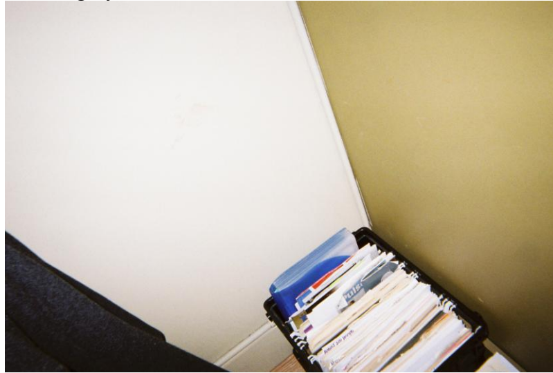
Figure 1.2. The accounting system that was created for the company filed neatly away from Case 3

Figure 1.3 focused on having the right amount of inventory to establish a solid business foundation.