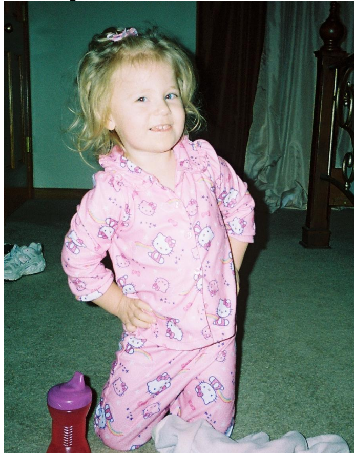
Figure 5.1. The daughter of the bridal store owner showing this is how she defines success – through her children.