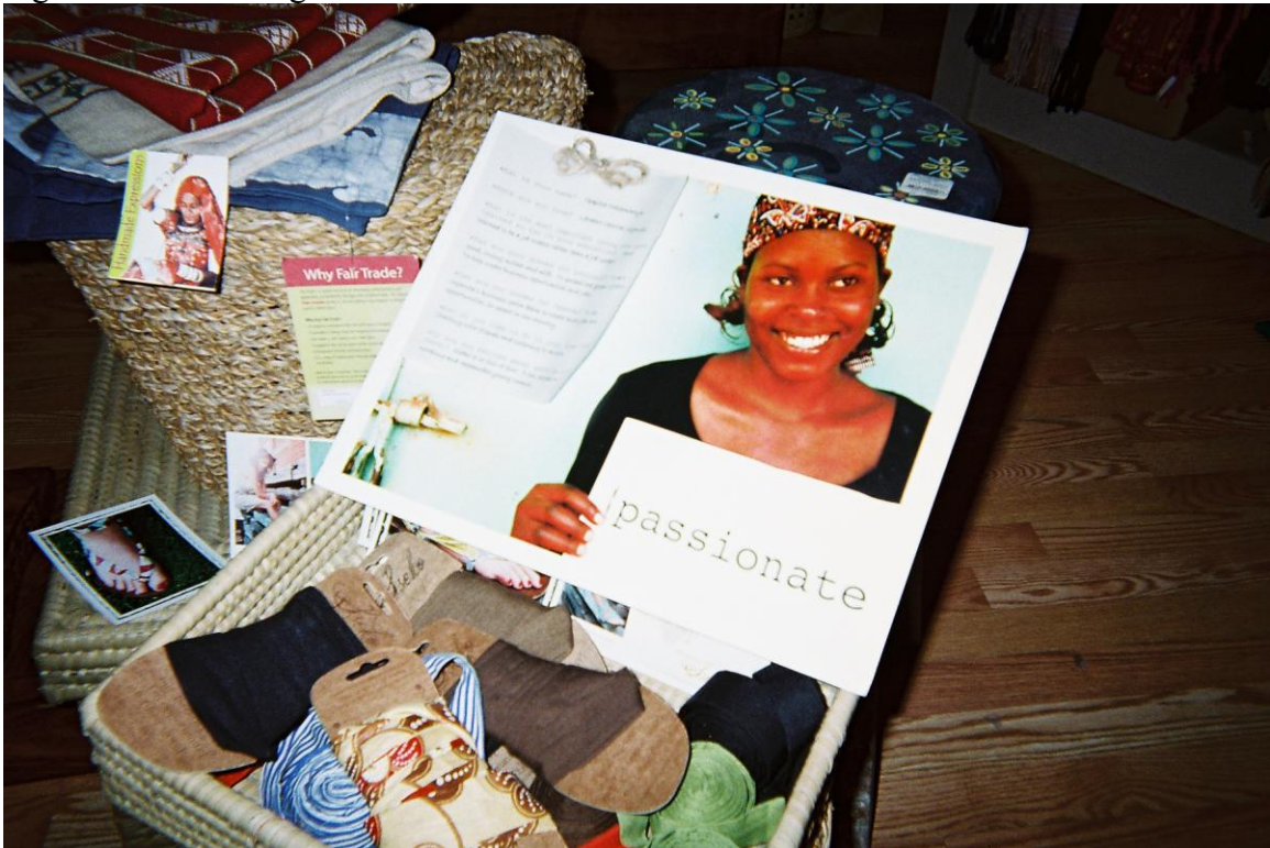
Figure 2.2. The owner from the fair trade retail business has signs around the store educating their customers about fair trade and the vendors they are helping.

The owner from the college couture retail store loves seeing her customers out on the town. For her, noticing a girl who she had styled out earlier in the day or had been shopping the store for years enjoying a night out and looking fabulous as a huge form of success for the owner. She describes one of her most prominent moments of feeling successful in this way: