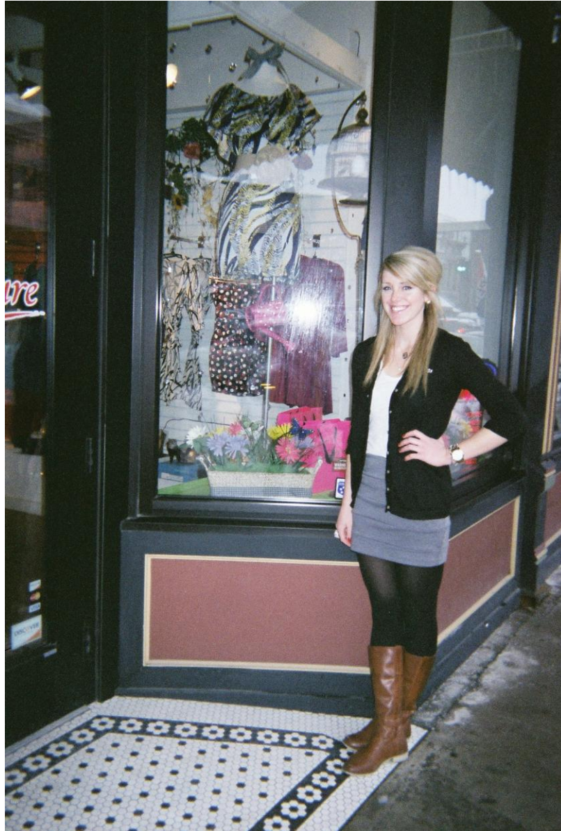
Figure 4.2. The owner of the college couture retail store finds flexibility through SME ownership by hiring individuals who can assist with projects around the store, including this employee who designs and builds the window displays.

The owner of the fair trade retail store understands flexibility and identifies it with her success through time management, and understanding that it's not always possible to accomplish everything at once. Figure 4.3 is a picture of her dirty kitchen, showing that