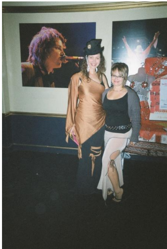
Figure 3.1. Customers in garments created by the owner from the dancewear retailer that participated in a community belly dancing show.