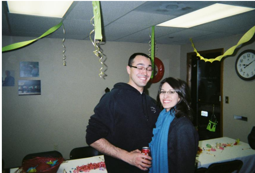
Figure 5.2. The owner of the fair trade retail store and her husband attending a church sponsored couples retreat, noting the importance of spending time with her spouse in achieving happiness in her personal life