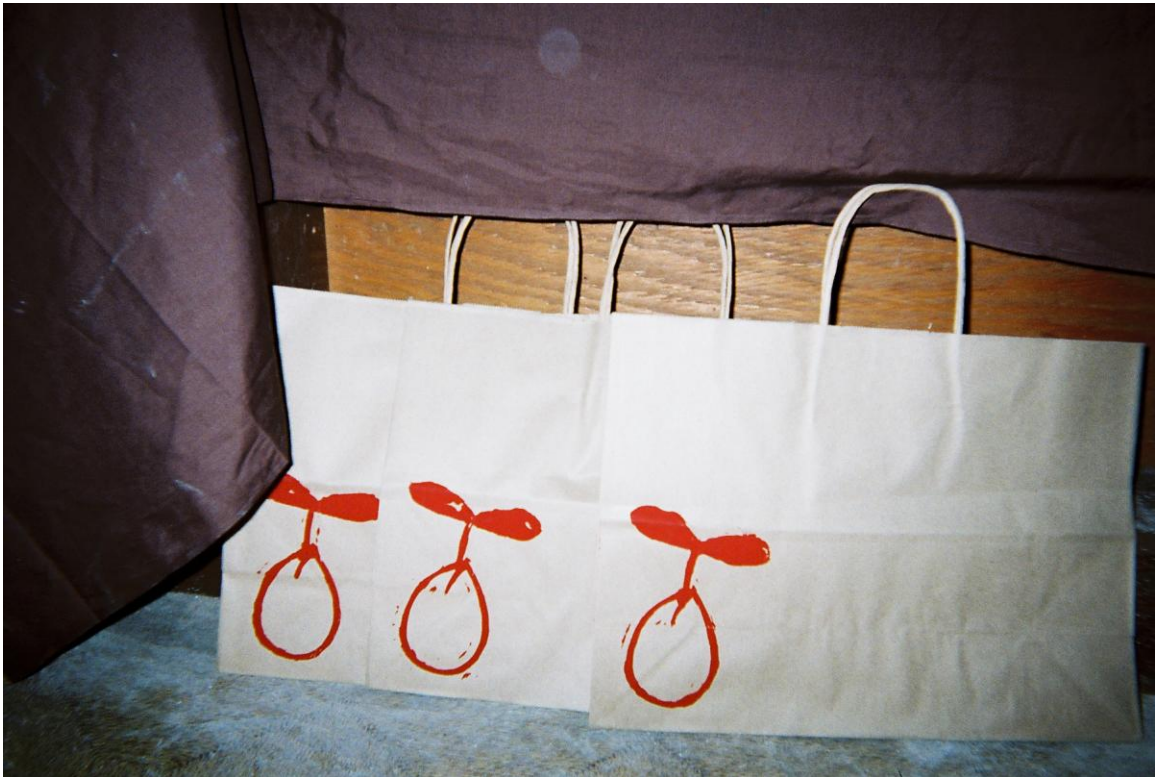
Figure 4.4. The owner of the fair trade business store finds flexibility in her time through being able to delegate tasks to her team of volunteers, such as hand stamping their retail shopping bags.

The business owner participants described having flexibility through SME ownership through having control over their schedule to accommodate children and spouses, as well as learning time management in their personal and professional lives. These may be related to Maslow's (1943) esteem level of the hierarchy of needs. At this level of the hierarchy, people desire strength, achievement and confidence as well as the desire for respect status and recognition. Through being able to delegate tasks to volunteers, allow employees to help without micromanaging, these business owners seemed to be able to achieve this.