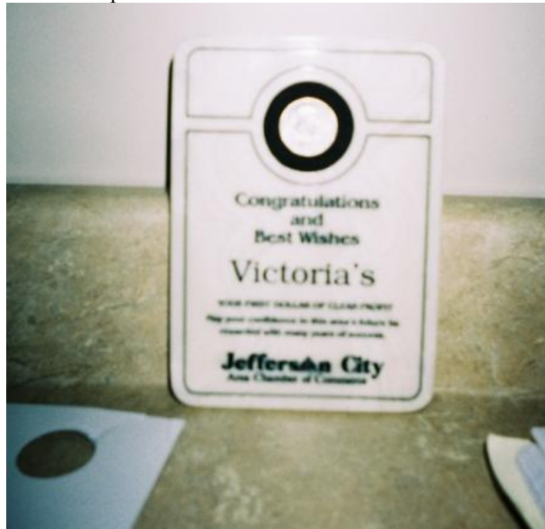
Figure 1.1. The first dollar of profit plaque from the bridal retail store from Case 1.