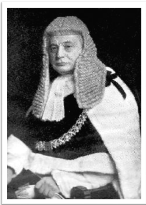
Lord Chief Justice Rayner Goddard