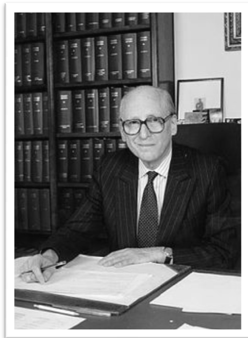
Lord Chief Justice Thomas Bingham