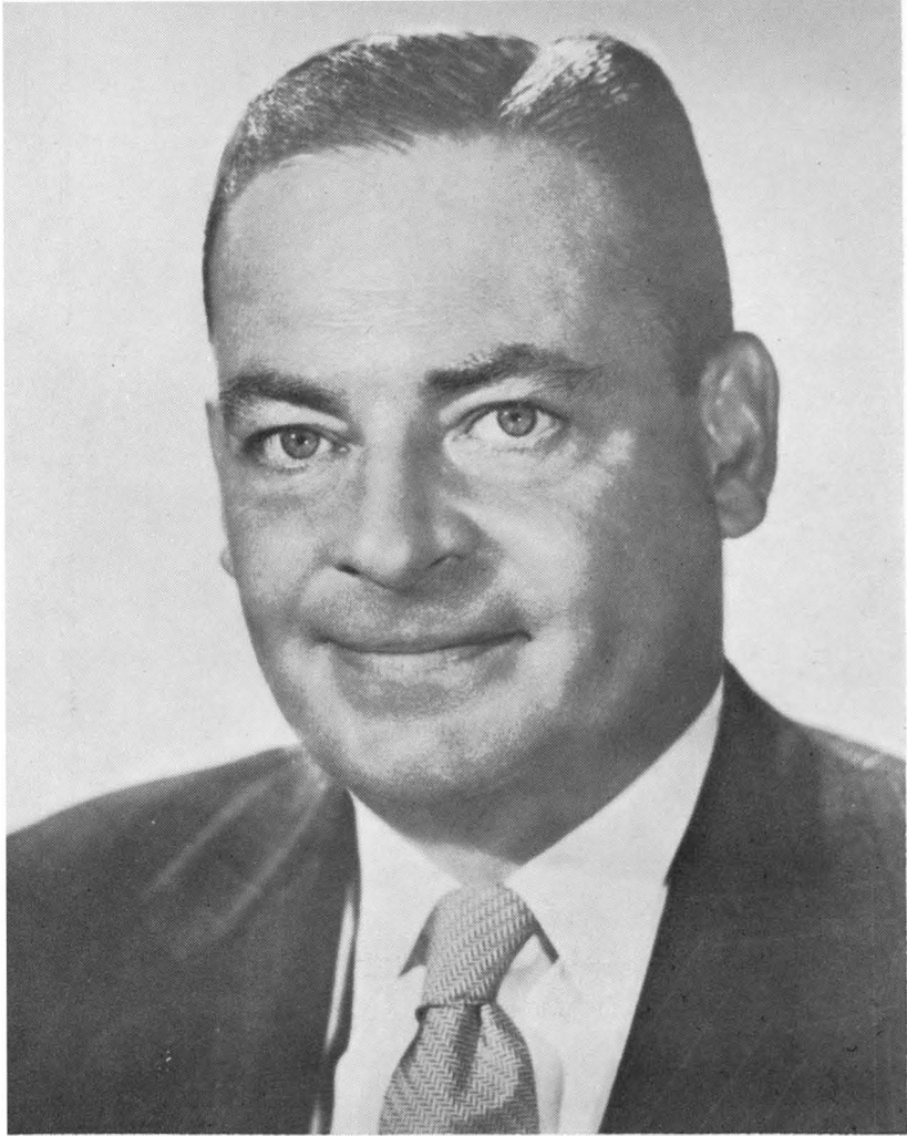
SENATOR THOMAS C. HENNINGS, JR.