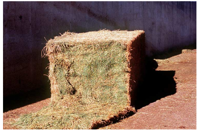
Figure 5. Large square bales can be efficiently transported and handled but require a large initial investment in equipment.

Formed haystacks have declined in popularity over the past 15 years. As with large round and large square bales, formed haystacks are designed to minimize handling and feeding costs. The stacks are often as large as 12 feet tall and contain 3 to 6 tons of hay. These bales