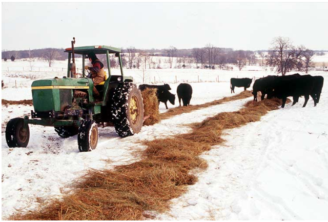
Figure 4. When large round bales are unrolled and fed on the ground as loose hay, losses as high as 40 percent can be expected.

or processing bales is that it gives you the opportunity to move the hay feeding areas around the pasture and distribute manure and nutrients evenly over a large area.