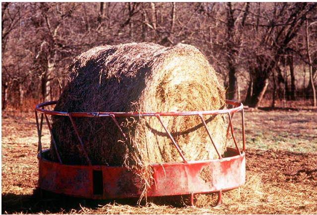
Figure 2. A hay ring permits feeding of large round bales in the field with minimal loss.

rings usually cost about $125 each), but feeding losses are low, even if a seven-day supply of hay is left at one time (Table 1). Feeding hay in racks or rings is crucial for producers who do not or cannot feed hay to their cattle on a daily basis.