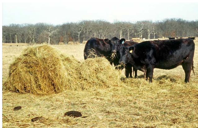
Figure 1. Losses can run as high as 50 percent if hay is not fed properly.