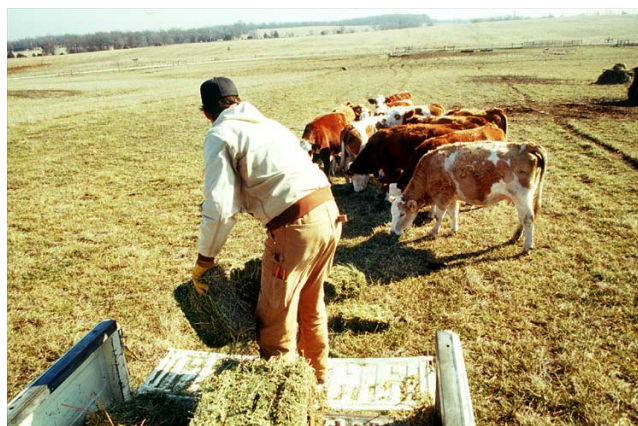
Figure 6. To minimize losses with small square bales fed on the ground as loose hay, distribute daily amounts throughout a pasture.

No matter what size hay package or feeding style you use, some hay will be lost or wasted. Proper feeding management minimizes these losses. Since hay is some of the most expensive feed used on beef operations, it makes sense to try to keep waste as low as possible through good management practices.