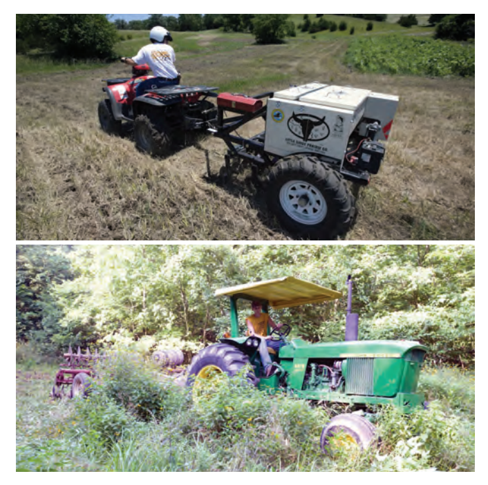
Figure 5. Consider what equipment and implements are available when planning a food plot, as they can affect the plant species that can be successfully planted, as well as the size and location of a food plot. For example, remote plots can be inaccessible for some equipment, such as large tractors, planters and other implements.

more beneficial for deer. Smaller food plots can be useful but tend to produce less forage due to browsing pressure and shading. Food plots larger than 5 acres can be designed with corridors or hedgerows of trees planted at 50-yard intervals to create visual breaks and provide screening cover (Figure 4).