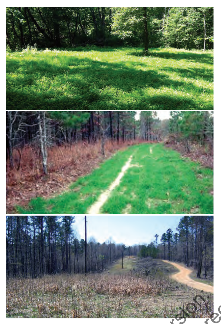
Figure 2. Woodland openings, logging roads and right-of-ways provide excellent locations for establishing food plots.