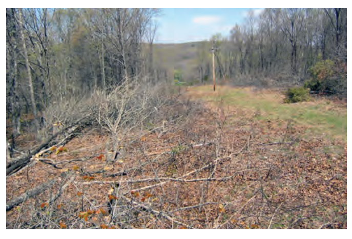
Figure 3. When establishing a food plot along a woodland edge, locate it 30 to 50 feet from the tree line and conduct edge feathering practices to allow a soft edge and transition zone of forbs, shrubs and vines to develop around it.

Areas where deer travel and areas near habitats that provide protective cover are ideal locations for food plots. Food plots can also be established in woodland openings