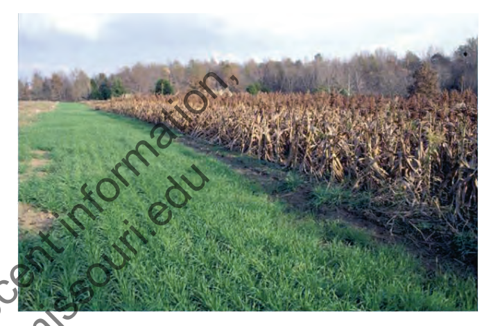
Figure 7. Plots can be planted with a grain crop and a cool-season forage such as winter wheat and clover. Larger plots have a better chance of withstanding heavy browsing pressure.