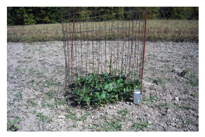
Figure 12. Exclosure cages are easy to construct out of 2-by-4-inch-mesh welded wire and a T-post, and provide a way to monitor browse pressure.