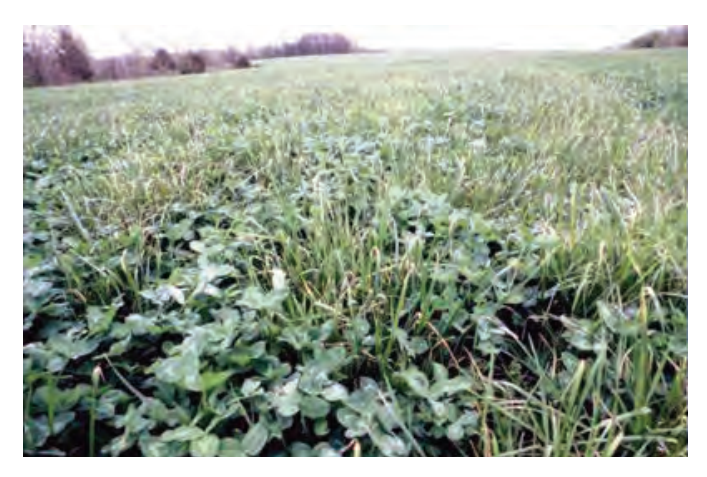
Figure 8. Adding legumes, such as various species of clover, with plantings of winter wheat or oats can provide a nutritious source of food during fall and winter.

food plot forages — such as clover, winter wheat and rape — grow during the fall and spring when temperatures are cooler. These forages provide sources of quality nutrition when other foods may be limited. They help bucks recover from the stress associated with breeding season and can increase hunting opportunities on the property. Annual grains such as winter wheat or oats planted alone or with various clover varieties will provide a source of nutritious foods during the late fall and winter (Figure 8).