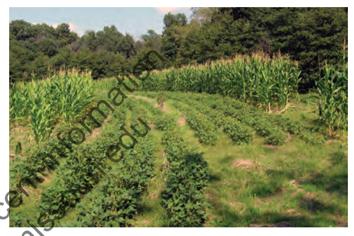
Figure 4. Visual barriers and screening cover such as hedgerows or corn plantings provide security for deer and can result in more deer sightings and hunting opportunities.

or adjacent to forest edges, idle areas or open fields. Other possible food plot locations include along rights of way, logging decks, fire lines and woodland roads (Figure 2).