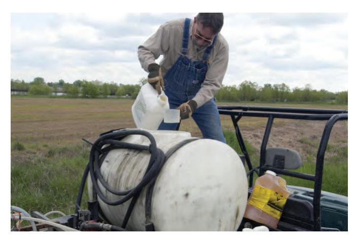
Figure 11. Weeds may need to be controlled with herbicides to prevent them from competing with forages.

Controlling competing vegetation is a recommended management practice. Grasses are generally not considered to be a preferred food for deer in the summer, so various grass-selective herbicides may need to be applied as a postemergence application in broad-leaved warm-season