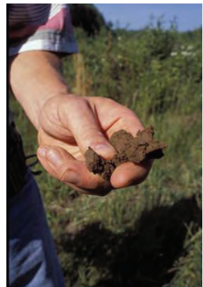
Figure 10. Collect samples and have the soil tested to determine fertility needs of area before establishing a food plot.

Potassium helps plants regulate water, absorb nitrogen, perform photosynthesis and transport nutrients. This important nutrient also increases root