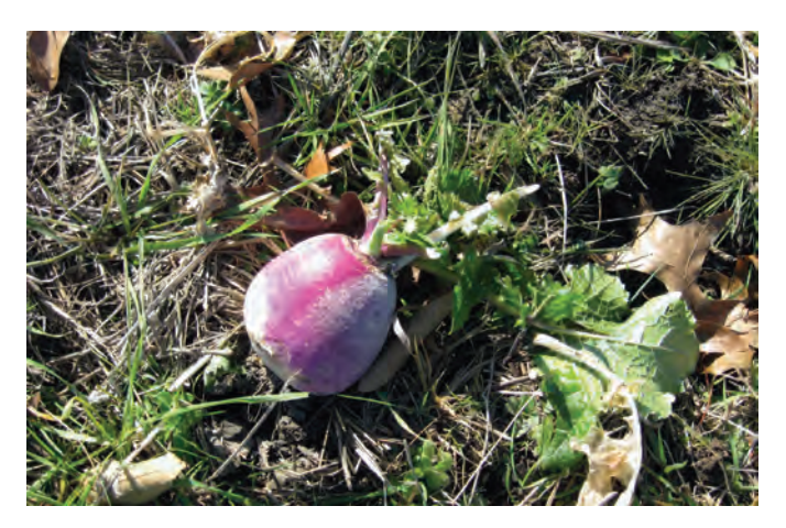
Figure 9. Plants in the Brassica genus, including turnips (pictured), rape, radishes, kale and canola, can be used in food plots.

The use of cool-season perennial forages in various mixtures can be beneficial. Perennial clovers and many