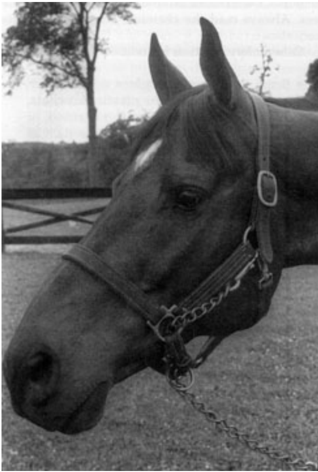
Figure 2. When not using the lead shank as a restraint, put it through the bottom and left halter rings and attach it to the throatlatch ring.