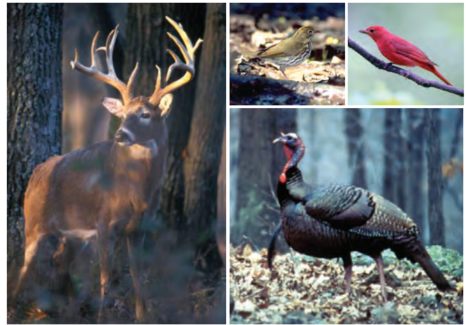
Figure 1. Woodlands and forests provide habitat for a diversity of wildlife species throughout the year.

Begin your plan development by conducting an inventory of your property and identifying the vegetative cover types and forest stands that are present. Look for unique geological and vegetative features that should be protected or enhanced. For example, you may want to protect or enhance geological features such as springs, spring seeps and streams, and vegetative features such as den trees, desirable fruit-producing species, snags and glades. An