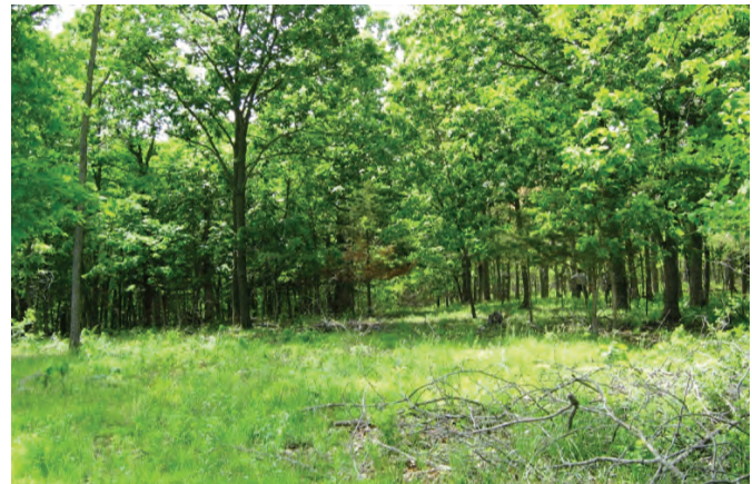
Figure 7. The closed canopy of trees on the left that has little herbaceous vegetation at the ground layer. The stand on the right has been thinned, resulting in an understory with diverse vegetation on the ground layer that provides abundant forage and cover for wildlife.

be implemented to increase a woodland's potential for providing valuable timber products and to improve forage production and wildlife habitat.