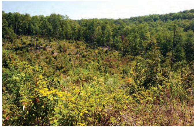
Figure 3. Clearcutting allows for a new crop of trees that are the same age to be regenerated in the stand. The vegetation growth that occurs provides excellent browse and cover for many wildlife species, including white-tailed deer.

Clearcutting may be the best way to improve a stand that is dominated by less than desirable tree species. Den trees and snags can also be marked before the harvest and left on the site to provide wildlife benefits. In most cases, areas can be harvested to create a patchwork and diversity of plant successional stages, particularly if the property is located in an area that is dominated by large areas of forest. The openings that are created favor the regeneration of desirable mast trees, such as oaks and hickories. If you do not wish to cut an entire stand, harvesting 2- to 10-acre patches on a 10- to 20-year rotation will result in an increase in browse — the leaves, twigs and shoots that many animals feed on — and creates habitat for wildlife species requiring early successional stages while still providing areas for regeneration of shade-intolerant tree species.