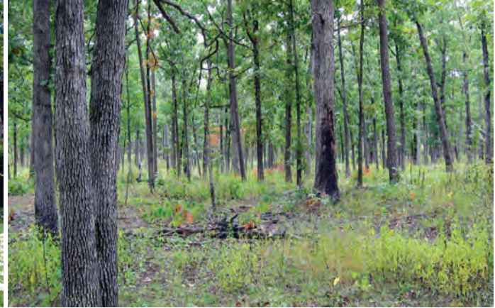
Figure 5. A variety of intermediate treatments, including FSI and thinning practices, can be implemented to improve timber quality and enhance the habitat for various wildlife. Prescribed fire can also be used as an intermediate treatment in certain stands to enhance the growth of herbaceous browse and annual plants that benefit various wildlife species.