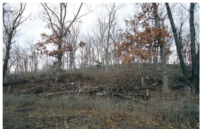
Figure 11. Brush piles created near field edges and in other strategic locations provide escape cover for many wildlife species.

Brush piles provide a place for select wildlife species — such as small mammals, cottontail rabbits, ground-nesting birds, reptiles and amphibians — to escape from predators. Proper construction and placement is extremely important. Brush piles should be at least 6 to 8 feet tall and wide. They can be created using limbs and other debris from trees and brush that were cut during a FSI (Figure 11). Place brush piles in strategic locations near food sources along field borders or in locations near other types of escape cover.