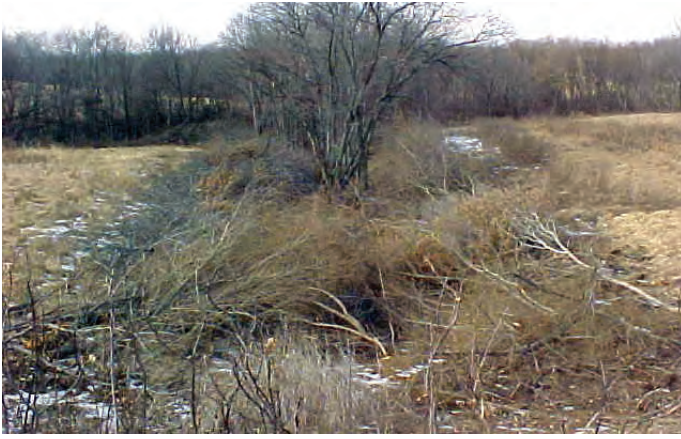
Figure 10. A nonforested edge can be improved for wildlife by edge feathering and improving the transition zone between fields.

A forest edge is created when a woodland road, a logging deck or a regeneration or group selection cut is made within a stand of timber. Tornadoes, high winds and fire are natural events that can also facilitate the development of this type of edge habitat. Forest edges are typically evident for only a short time, from five to 15 years. As plant succession advances and the regeneration trees grow larger, a forest edge disappears. However, disturbances in the forest will encourage the growth of a variety of trees of different ages, heights and densities, providing structural diversity within the stand and enhancing nesting and foraging habitats for a variety of wildlife species. These disturbances are important because nearly 70 percent of the 260 wildlife species occurring within the central U.S. hardwood forest region require successional stages that are less than 40 years old to meet at least part of their habitat requirements.