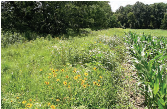
Figure 14. Field borders of native warm-season grasses, forbs and legumes created between crop fields and woodlands provide vegetative diversity and habitat benefits for many wildlife species.