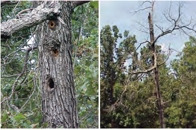
Figure 8. Den trees (left) provide wildlife with nesting sites and cover. When conducting a forest stand improvement or timber harvest, mark snags (right) and den trees to be left on the site.