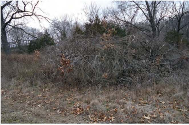
Figure 12. Hinge-cut trees and other types of downed-tree structures created near field edges provide escape cover for wildlife.

Downed-tree structures can also provide a temporary source of woody cover in areas where shrubs are lacking (Figure 12). These structures are sometimes called living brush piles — if the small trees are cut part way so that the top falls to the ground, a technique called hinge-cutting . This type of cover can be quickly created by cutting several trees to fall in a crisscross pattern over each other.