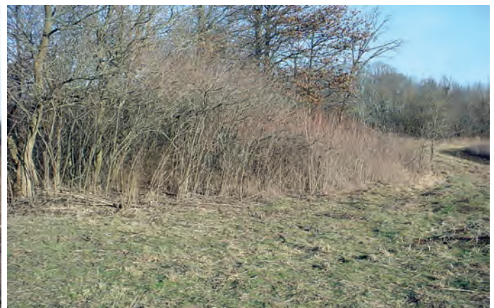
Figure 13. Patches of shrubs adjacent to fields and timber stands provide excellent escape cover for wildlife and are a habitat component that is often in short supply on farms in Missouri.