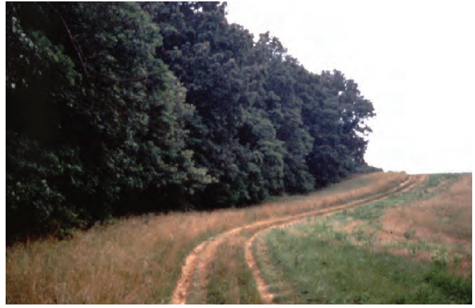
Figure 9. The “hard” edge between this timber stand and pasture could be “softened” through management practices such as edge feathering or creating brush piles and field borders to improve habitat conditions for a diversity of wildlife.

Prescribed fires should be planned to accomplish very specific management objectives, so it is extremely important to seek advice from natural resource professionals with the Missouri Department of Conservation (MDC) or MU Extension. They can help you develop a burn plan so that the fire is conducted safely and under exact weather and fuel conditions to accomplish your objectives and the desired changes in vegetation.