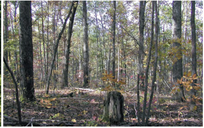
Figure 4. Small group openings within the forest can benefit many wildlife species and also promote the regeneration of shade-intolerant trees, such as species of oak.

woodcocks, ruffed grouse, yellow-breasted chats, indigo buntings, brown thrashers and blue-winged warblers. As these young stands regenerate and begin to mature, they go through a period, when they are 25 to 40 years old, during which herbaceous forage and browse are no longer available and hard-mast production has not yet begun. During this period, several required habitat components are not present in the stand unless FSI and thinning are practiced. These intermediate treatments are described in greater detail below.