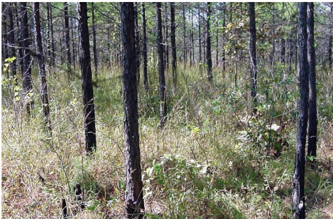
Figure 6. Thinning a stand of timber, such as this stand of short-leaf pine, can improve the growth of the remaining trees as well as enhance the availability of forage and browse for wildlife.