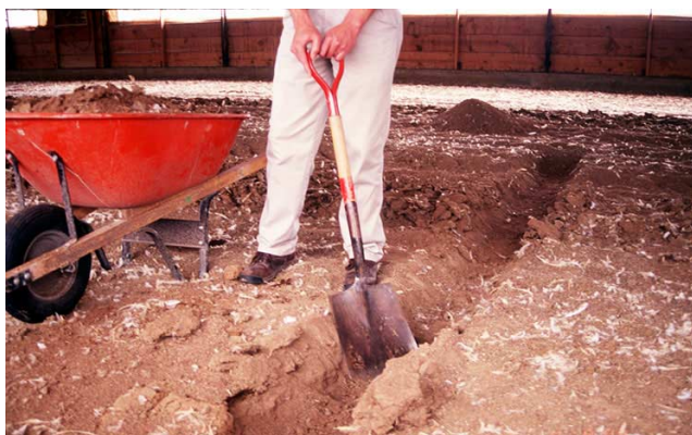
Figure 3. The trench method. Use the blade of the shovel to chop the cake so the trench has square sides down to just above the soil surface.