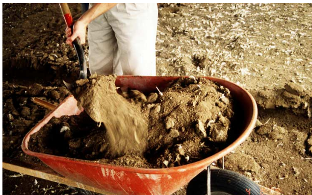
Figure 4. Be sure to crumble chunks of caked litter into small pieces and thoroughly mix the litter before removing your sample.

Often the amount of material collected from the two trenches will exceed the capacity of the wheelbarrow. When this happens, crumble and thoroughly mix the material in the wheelbarrow each time it is two-thirds full with material from the trenches. After mixing, place one shovelful in the 5-gallon bucket,