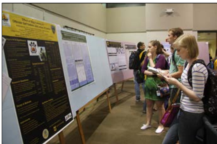
Phi Zeta Day 2014 saw record participation at the MU College of Veterinary Medicine with 59 individuals presenting posters detailing their research and another 22 giving oral presentations. The posters were displayed in the Adams Conference Center.