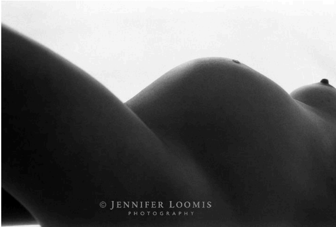
Maternal Landscape Series, 2012