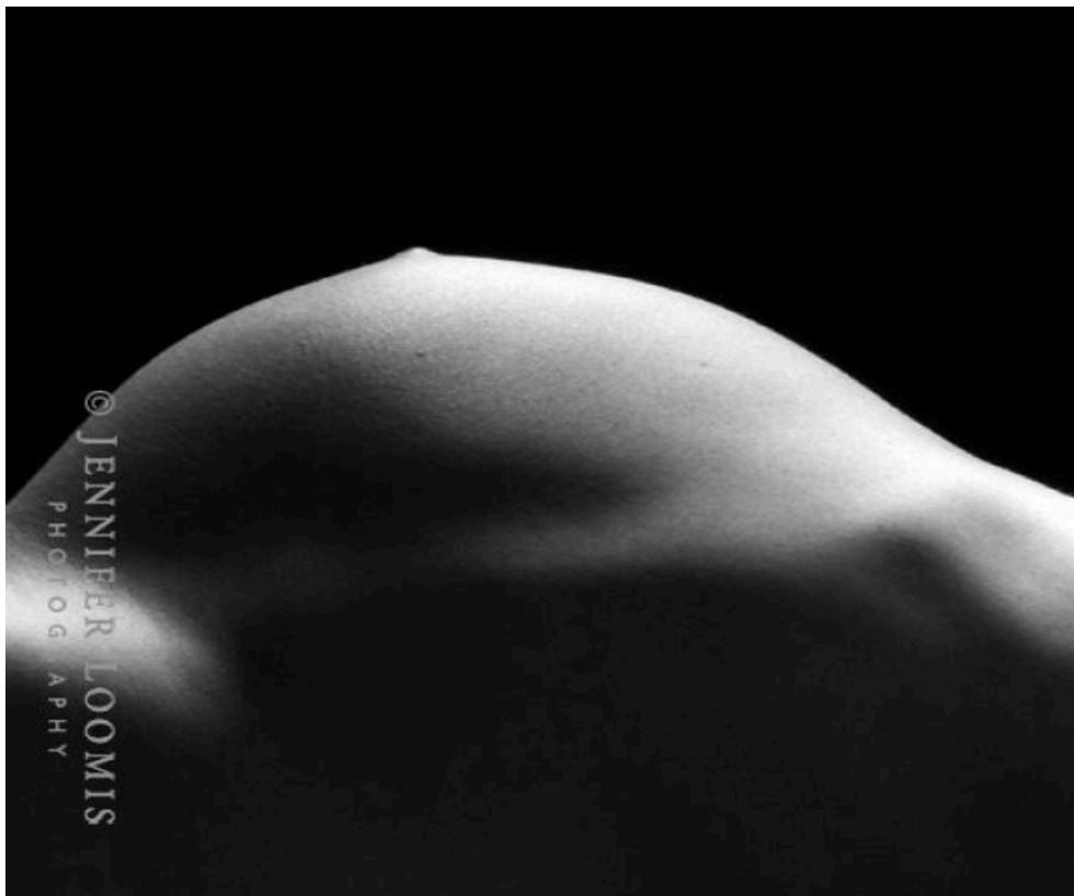
Maternal Landscape Series, 2013