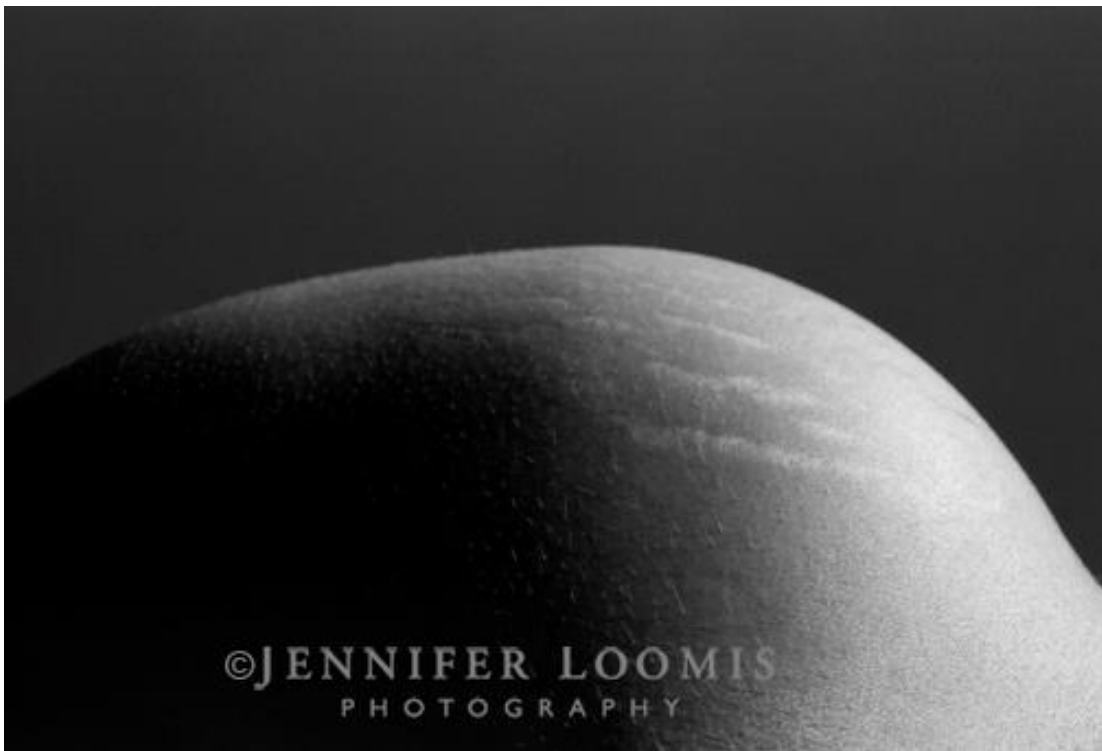
Maternal Landscape Series, 2013