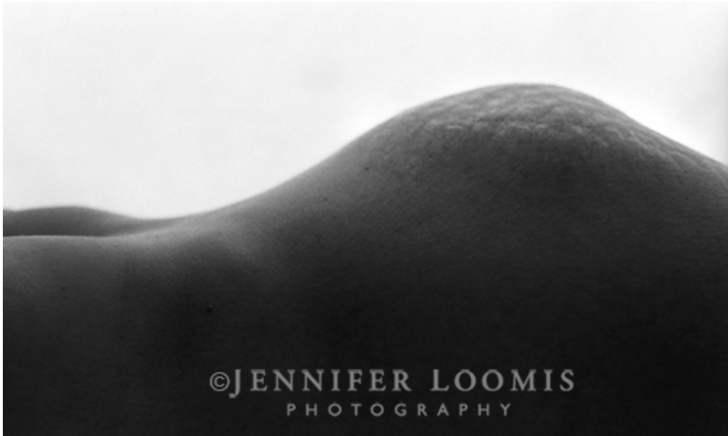
Maternal Landscape Series, 2012