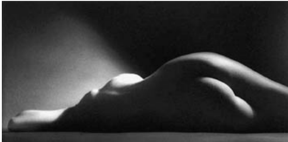
Sand Dune, 1967 Ruth Bernhard