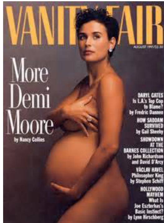
Vanity Fair, August 1991

celebrities have posed for photos in late stages of pregnancy, and the trend of having intimate pregnancy photos of the female form was born.