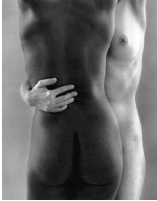
Two Forms, 1962 Ruth Bernhard