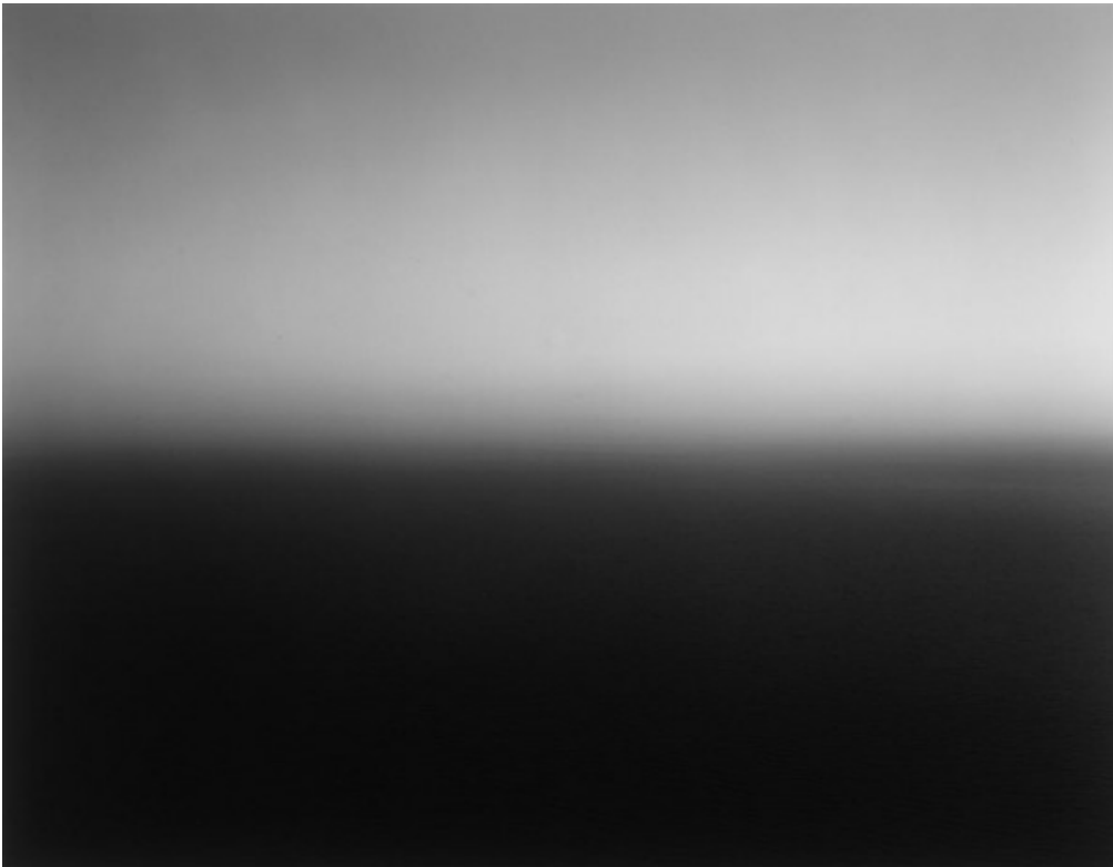
Mediterranean Sea Hiroshi Sugimoto

Loomis looks at pregnant women as the backbone of society and is using her maternal landscape work to make people get up close and personal to it. In line with Loomis's rebellious side, she wants the images in their face where they can see the lines and stretch marks and really study it. Loomis has printed large-scale prints of the landscapes from 6-feet to 12-feet wide. She found that if she "could create it as a landscape that becomes unidentifiable, more people will get up close to it and then be like "what is this?"