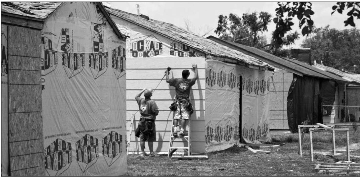
Mike Hutmacher/The Wichita Eagle