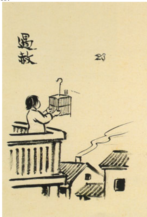
Figure 1.11 – Cartoon by Feng Zikai in a lilong setting (Zikai 1928 from the Huntington Collection of Buddhist and Related Art).