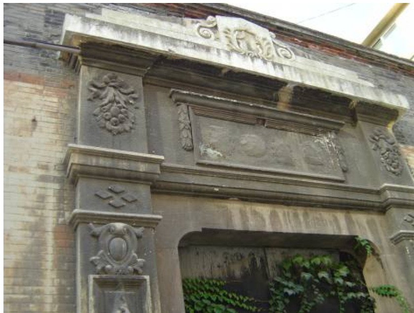
Figure 1.12 – Lilong entrance on which the name of the lilong was covered over during the Cultural Revolution because it contained “feudal” elements.

Residents of lilong have a strong community bond because the vast majority are long term residents. An informal system of cooperation exists in which residents depend on each other, for example it is common for one of the residents to offer baby-sitting services (Morris 1994). Residents of lilong are proud of their living space and like to proclaim “this is my lilong” (Ged 1992). Lilong are often named and one name that is particularly popular for lilong is Ping An Li meaning safe and secure (Huang 2004). The name of the compound was often displayed above the main entrance (Figure 1.12). These names allowed residents a sense of belonging to each compound and were quite useful to the postal service (Lu 1999).