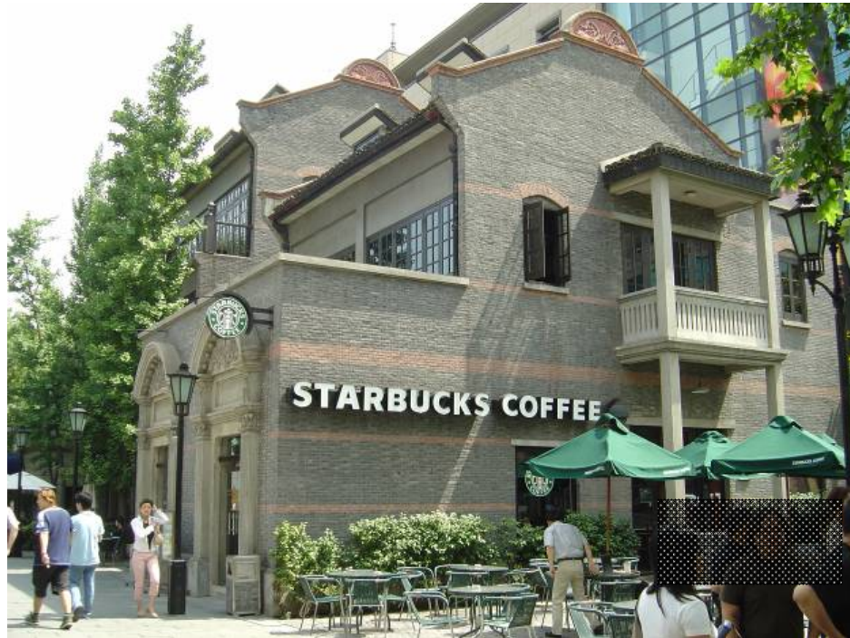
Figure 5.1 – Starbucks in Xintiandi.

complete international shopping experience. Former residents of this neighborhood must find it unusual to see these shops located in a facsimile of their former neighborhood on the same piece of land. The sense of place regarding the new Xintiandi would prove fascinating.