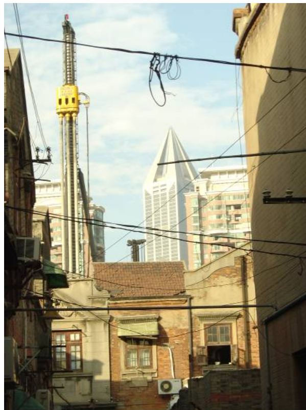
Figure 1.5 - Lilong, cranes and skyscrapers near Nanjing Xie Lu.

Shanghai has embraced this new role given to it by the national planners in Beijing and has quickly expanded in size. By 2004, Shanghai boasted 1/5 of the world’s construction cranes and follows the slogan “development is the irrefutable truth” (Figure 1.5).