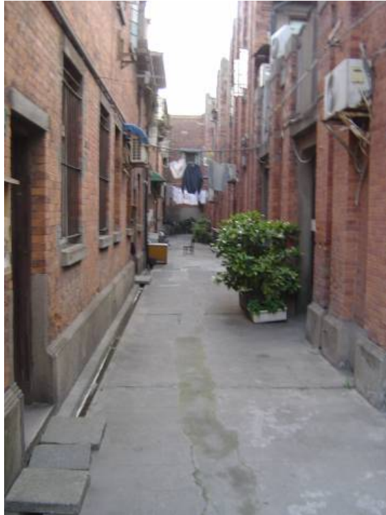
Figure 1.10 - Lilong that is in relatively good conditions and has some improved facilities such as air conditioning.