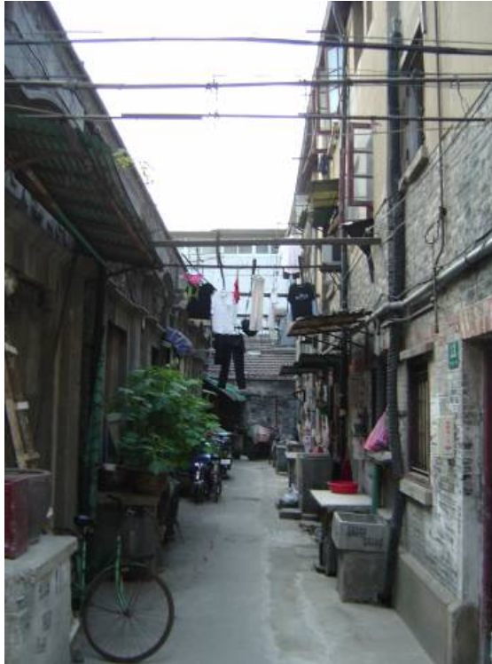
Figure 1.8 – Lilong alleyway with public sink.