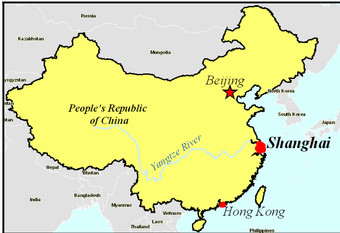
Figure 1.3 – The location of Shanghai in the People’s Republic of China.

Concessions were initially granted with the explicit desire from both the Chinese and European negotiators for racial segregation. This might have remained the case had it not been for the 1853 uprising of the Small Dagger Society, also known as the Small Sword Society or Xiaodaohui, and the concurrent Taiping Rebellion. The main goal of these uprisings was the overthrow of the ruling Manchu Dynasty. Residents of the international settlements were unable to avoid the effects of the conflicts and soon became involved. Western powers assisted Chinese authorities against the rebellions to preserve the Manchu government and the status quo that had so richly rewarded them. As large numbers of Chinese fled into the relative security of the international settlements, segregation in the city largely came to an end. Between 1853 and 1854, the Chinese population of the foreign settlements increased from 500 to 20,000 (Lu 1995).