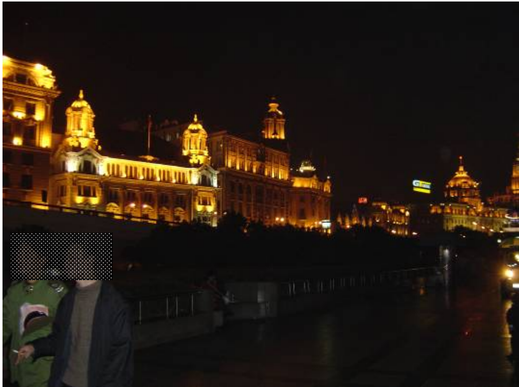
Figure 1.2 – The Bund at night.

2004). Much of this was built using Chinese petty criminals unfairly sentenced to forced labor in the courts of the concessions (Ye 2003). Many of the larger structures built at this time are still standing and concentrations of them are well preserved along Shanghai's historic waterfront known as the Bund (Figure 1.1).