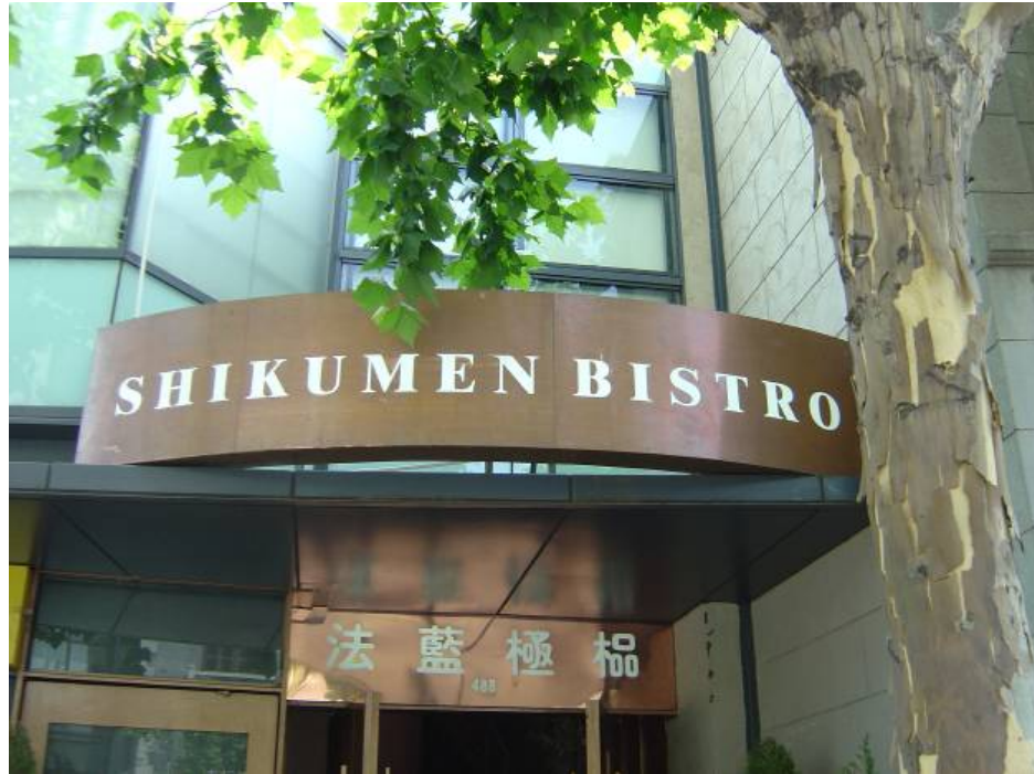
Figure 5.2 – The Shikumen Bistro an upscale restaurant named after one of the five subtypes of lilong.

The sense of community in modern apartment communities of suburban Shanghai also holds interesting research possibilities. As evidenced in this research the residents of Shanghai clearly desire a strong sense of community, but have been unable to achieve this in their current settings. The opening of doors physically and metaphorically is important to the Shanghainese psyche. Only future research can indicate if the sense of community in modern Shanghainese apartments can increase.