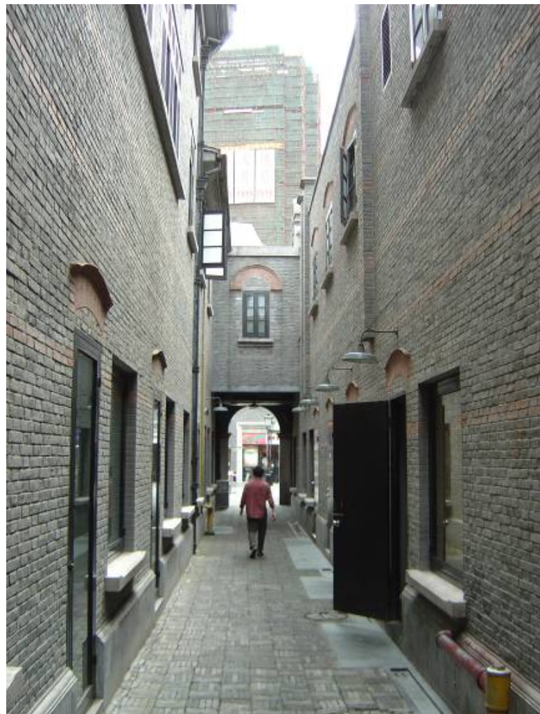
Figure 1.4 – Lilong alley near the site of the First National Congress of the CCP.

Lilong housing represents not only the broad sense of history in Shanghai, but was also important in housing people and events of import. Chen Duxui, the first leader of the Chinese Communist Party (CCP), was a lilong resident. The First and Second National Congresses of the Chinese Communist Party were held in lilong buildings (Figure 1.4) that had been renovated into a school and are well preserved to this day (Lu 1999).