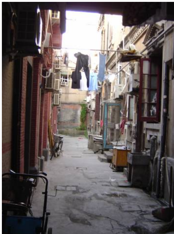
Figure 1.9 – Lilong alleyway with hanging clothes.