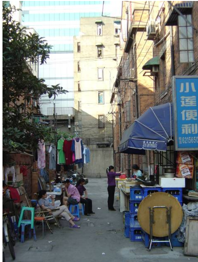
Figure 1.7 – Stores within a lilong complex. Notice the six story “modern apartment” in the near background and the truly modern office building in the far background.

stability, community cohesion, and economic viability. Often the lilong, in rows forming the outside of the compound, were converted to storefronts (Figure 1.7).