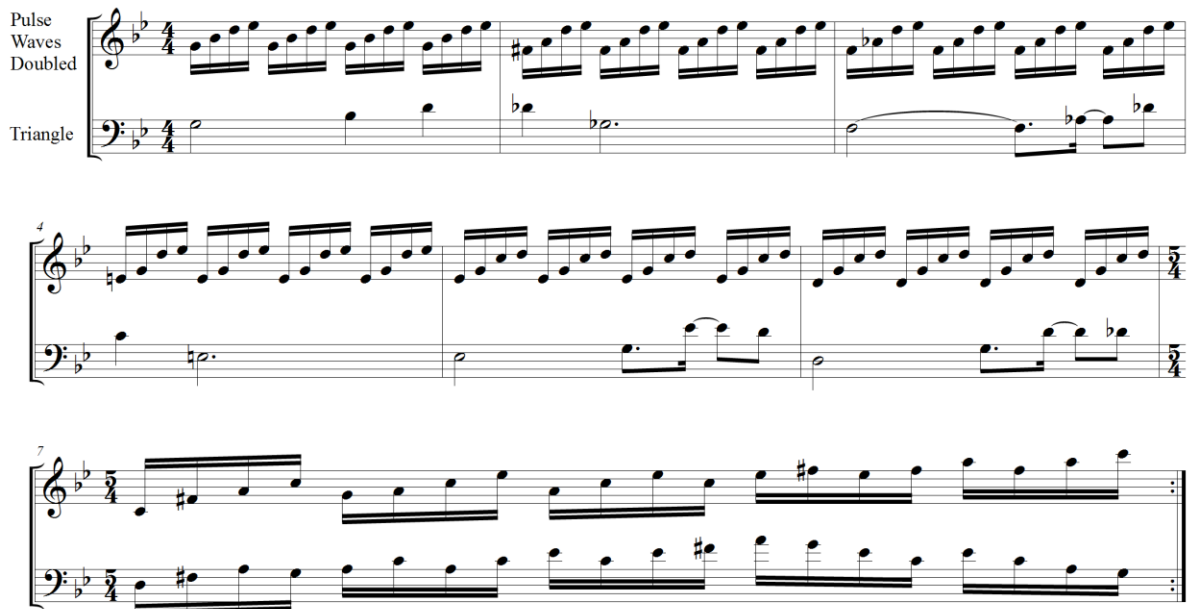
Example 4.2 Koji Kondo, “Dungeon Theme,” in The Legend of Zelda , mm 1-7.

at the end of each arpeggio leaves the piece sounding constantly unresolved. The lack of the percussive noise channel in combination with the relentless motion of the pulse channels evokes a feeling of going nowhere fast. There is motion, but unlike the stable surety of the Overworld, it is a motion without direction.