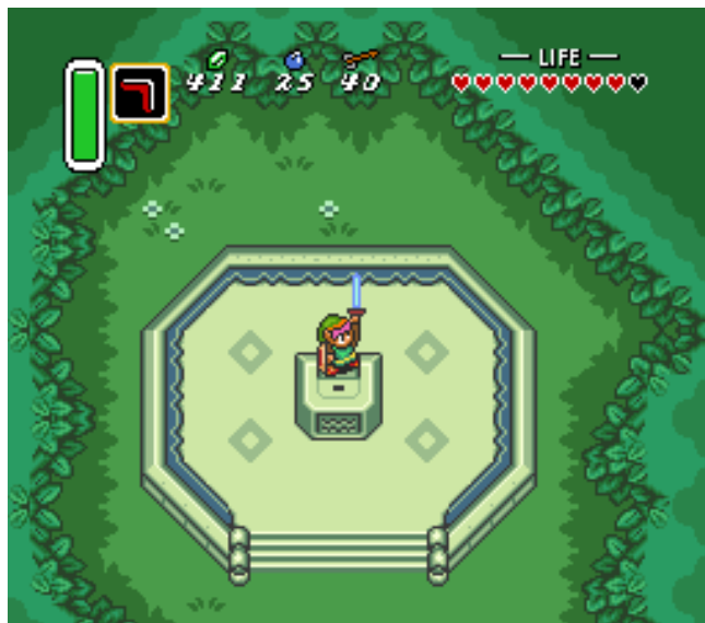
Figure 4.2 The Legend of Zelda: A Link to the Past . Link finds the Master Sword deep in the lost woods.

Princess Zelda is connected to otherworldly elements through the timbres in Zelda's lullaby. The instrumentation is mostly for strings, but for the second phrase, Kondo adds a vocal line (connecting Zelda to the Sanctuary cue). A later version of the lullaby appears when Link has gathered all seven maidens. Added to the string melody and accompaniment is a descending figure played by a harp, a timbre which appears when Link stumbles upon the fairy fountains. These magical places are the home of fairies who help Link by restoring health. Each of these cues is timbrally and motivically connected to one another to suggest a relationship to the narrative. Zelda, one of the mystical seven maidens, is connected to this otherworldly power through the vocal timbre of her lullaby. She also has one foot in the world of Hyrule through her string melody, a timbre which does not appear in other magically associated cues.