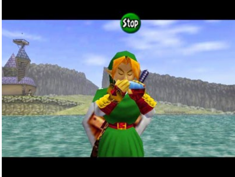
Figure 4.3 The Legend of Zelda: Ocarina of Time . Link begins playing a song on his ocarina.

One function of the ocarina is to transport the player to an area he or she has already visited. As Whalen states, the music which the player uses to transport Link is directly tied to the area to which he or she wishes to go. For example, Link can transport himself to the Temple of Time by playing the first six notes of its theme, A, D, F, A, D, and F. 17 Playing these notes triggers an animation, turning the interactive music noninteractive. Transporting to the area also changes the music from diegetic to nondiegetic, as the background chant takes over (Example 4.5). More than just identification, the ocarina is the center of musical cohesion in Ocarina in both key relationships and orchestration. 18