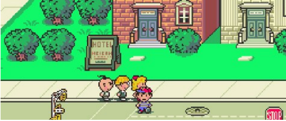
Figure 3.2 Earthbound . Ness, facing front, stands outside a hotel with his friends, Poo, Jeff, and Paula.