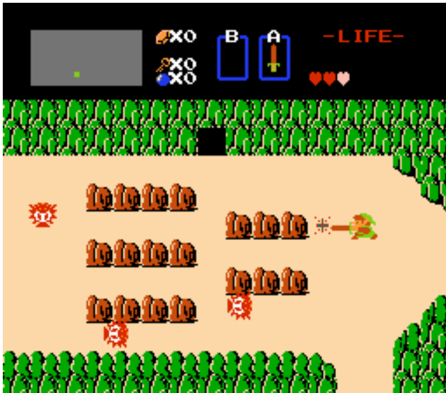
Figure 4.1 The Legend of Zelda . Link swings his sword on the Overworld map.

imitative countermelody. Both are underpinned by rhythmic triangle bass and noise channels. The noise channel emulates the patterns one might find in a marching band snare drum. Though it is set in a firm B-flat major, the theme has enough harmonic interest to sustain extended listening, an especially important facet since the open-world gameplay leaves the amount of time players will spend with the theme unpredictable. The first full phrase descends through borrowed chord harmony from B-flat to A-flat, G-flat, and F. The mode then switches temporarily to B-flat minor, before a dominant C chord turns the key back towards B-flat major. The second period maintains the same harmonic structure, but with added contrapuntal lines from the second pulse channel and some variation in the bass.