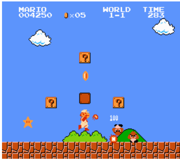
Figure 1.2 The first level of Super Mario Bros. on the Nintendo Entertainment System.

The end of the 80s and early 90s saw a shift in the setting of video games from the arcade to the home. Gamers increasingly began to turn to home consoles and personal computers, which offered games which could match the quality of technology and gameplay previously only held in the arcades. Nintendo's first real competitor came from another Japanese company, Sega, and their more advanced home console, the Genesis. The Genesis was the first real 16-bit machine, outclassing the NES in graphics, depth of gameplay, and musical capabilities. 16-bit refers to the processing power of the console's CPU, or how many bits it can handle at once. 25 The system used Frequency Modulation Synthesis, allowing composers to simulate closely the sound of acoustic instruments. Sega managed to steal much of Nintendo's consumer base with its focus on an older audience, all under the slogan, "Sega does what Ninten-don't!" The rivalry sparked an arms race, commonly known as the Bit Wars, in which each company strove for better looking graphics, improved sound,