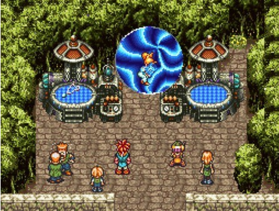
Figure 3.1 Chrono Trigger . Crono and Lucca watch as Marle is sucked into the time portal.