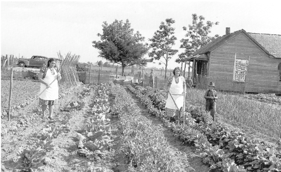
Figure 1. Women and children in their spring garden in southeastern Missouri.

food supply, but it also augmented family income with profits derived from selling chickens, eggs, butter, and fruit (Adams 1994; Neth 1995; Sharpless and Walker 2006). The home vegetable garden is an ideal place from which to explore women's agency because it is not only a gendered site on the farmstead where women, particularly during this time period, were able to develop skills and knowledge to enable them to feed their families, but it also was a site that enabled them to participate in the economic welfare of the farm. Farm women's social relations within the family, the neighborhood, and community were also mediated by the household vegetable garden as we shall see in this dissertation (Figure 1).