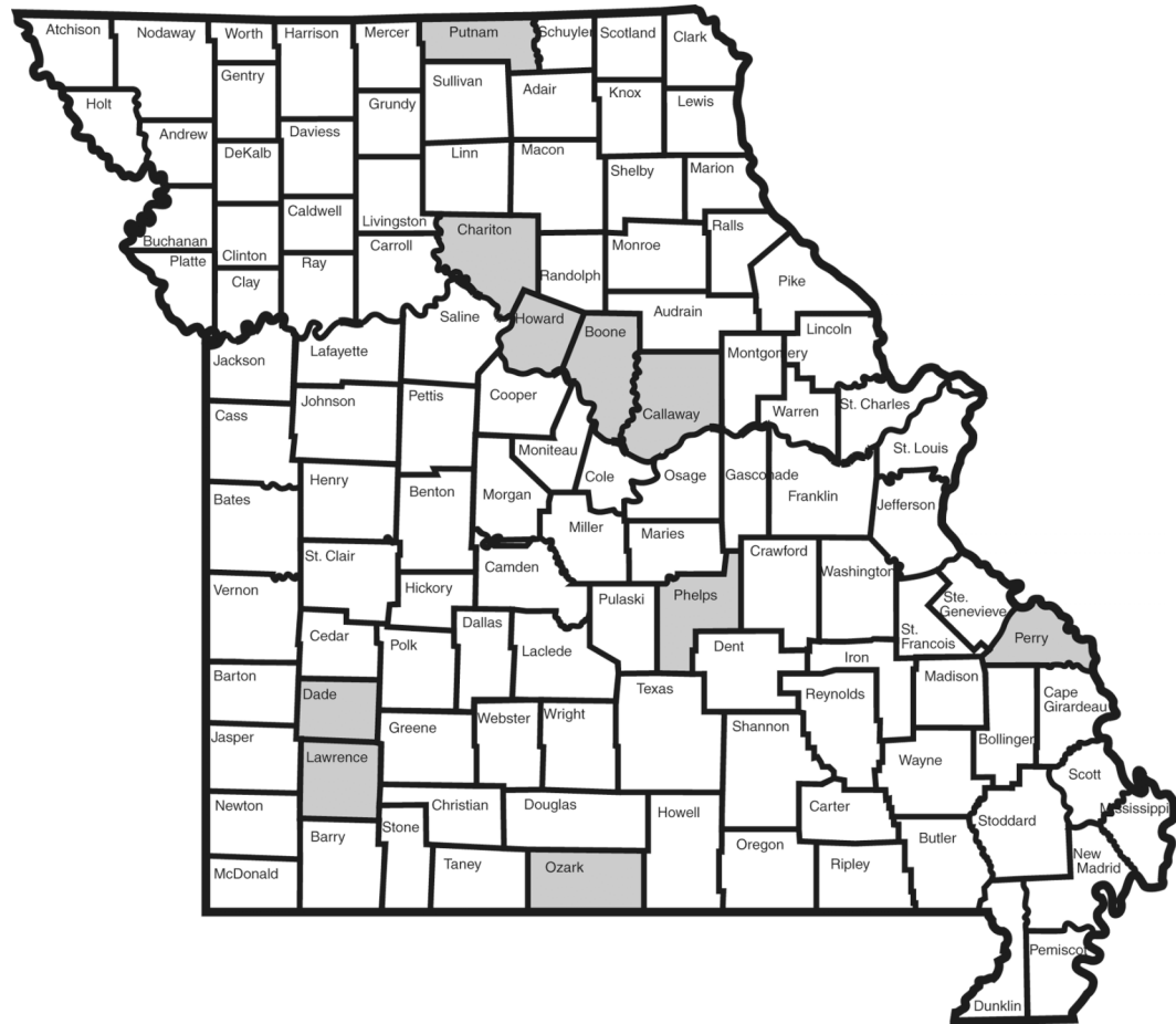
Figure 2. This map indicates the counties where my key informants lived during the Depression. Perry and Lawrence Counties are also highlighted because they are the counties where the clients of the Farm Security Administration lived (see Chapter 8).

The individual interview was audio taped and I personally transcribed them nearly verbatim. I summarized in the transcripts some of the material that seemed marginal to my primary interests, but kept the tape recordings so that I could review the material if necessary. The transcripts were reviewed by me for accuracy and then sent along with a thank you note to the interviewee requesting that they also review it to be sure that it represented what they intended to report. After the informants looked over the transcript, I made their suggested changes, which usually were minor, and sent them a final copy for their family records. In actuality, only five out of the nine responded with clarifications.