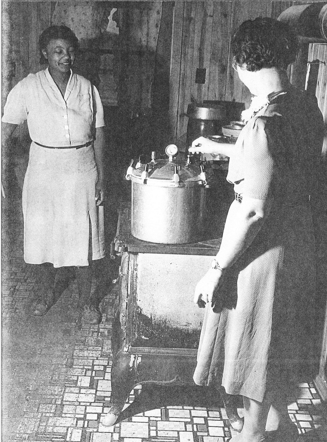
Figure 4. Completed farm homes in the FSA Southeastern Missouri project for the rehabilitation of farm labor. Home Supervisor demonstrating the use of a pressure cooker in a client's home. May 1940.