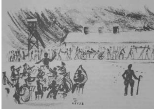
Figure 5: Orchestra playing as prisoners return from work details to the camp

orchestra. 74 For many prisoners, the reality of death and suffering transposed against the beauty of orchestra music proved too much to emotionally bare.