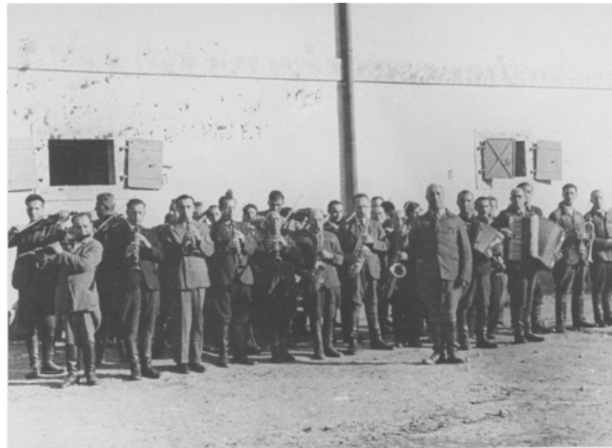
Figure 7: Orchestra at the Janowska Camp

Tangible benefits existed for the Jewish prisoners who played in musical ensembles. While many orchestra members wore the prison stripes, others donned formal wear. The well-dressed orchestra members at the Janowska concentration camp in Poland, seen in Figure 7, wore suit and boots during performances. 84 These uniforms would have been warmer during the winter and would have provided greater protection from the elements. The women’s orchestra at Auschwitz also had special uniforms for concerts. While these shirts, blouses, stockings and jackets, elevated the commandant’s grandeur, they also protected the women from cold temperatures faced by other prisoners. 85