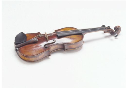
Figure 8: Henry Rosner’s Guadagnini violin

family after the war. 115 Rosner donated the Guadagnini violin, to the United States Memorial Museum in 1994 (Fig. 8). 116