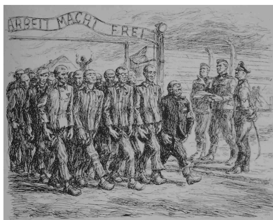
Figure 4: Marching to work with orchestra accompaniment

In the evening orchestras played as workers returned from their daily work detail. Some prisoners explained that the music inspired them to say alive. As one recalled: “We could clearly hear how our colleague musicians spoke to us in masterly fashion on the instruments...Don’t give up brothers! Not all of us will perish!” 72 Other prisoners saw the orchestras in a different light. In another image by Reisz, the orchestra plays in the foreground as prisoners transport the sick, injured, or dead back to camp on carts and stretchers, a dark cloud shrouds the camp buildings (Fig. 5). Prisoner Olga Lengyel remembered how, “the funeral procession was greeted with gay orchestra music.” 73 Survivor Benjamin Jacobs found such scenes of orchestras composed of prisoners nothing short of grotesque. “They followed his [the conductor’s] baton as if they were playing in a symphony