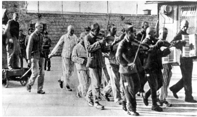
Figure 6: An orchestra escorts prisoners destined for execution