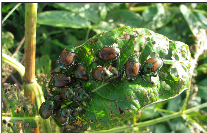
Figure 8: Japanese beetle adults and feeding injury

Japanese beetles ( Popillia japonica ) feed on foliage, blossoms and developing fruit in mid-summer and can cause severe economic damage if large populations are allowed to develop (Fig. 8). Fortunately, elderberry is not their favorite food, although they will readily eat it. Therefore, if the beetles are controlled at the first sign of infestations, subsequent groups of beetles will likely move to more preferred crops.