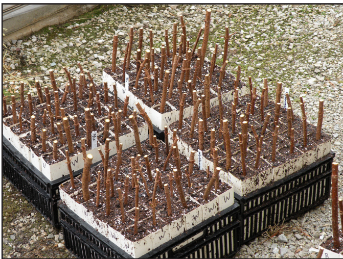
Figure 5: Hardwood cuttings in individual containers

Elderberries may be propagated by several means. Rooting dormant hardwood cuttings is a relatively easy and cost-efficient method for propagating large numbers of plants (Fig. 5). Collect vigorous, 2-4 node cuttings from the previous season's growth before budbreak, which typically occurs by early February. Be sure that the cuttings are not cold-damaged and are free of defects. Cuttings may be rooted immediately or stored under refrigeration for 4-6 weeks for later rooting. A dip of the basal end of the cutting in a commercial rooting powder (0.1% IBA) may increase rooting. Place the basal node(s) below the surface of a well-drained soil or sterilized commercial potting medium. Keep cuttings warm and moist but not wet. The cuttings will usually break bud and begin growing several weeks before rooting, but they should be well-rooted within six weeks.