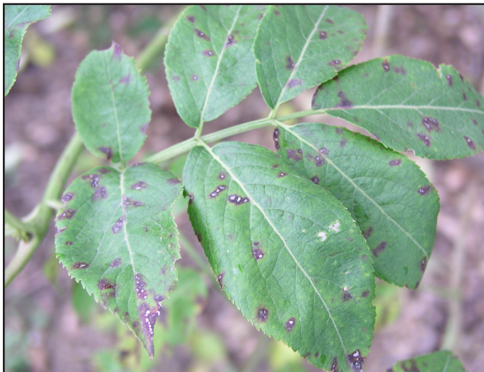
Figure 11: Bacterial spot on elderberry foliage

A bacterial leaf spot disease tentatively identified as Pseudomonas viridiflava (Fig. 11) has caused economic damage to elderberry in Missouri. Little is known about this disease or how to manage it.