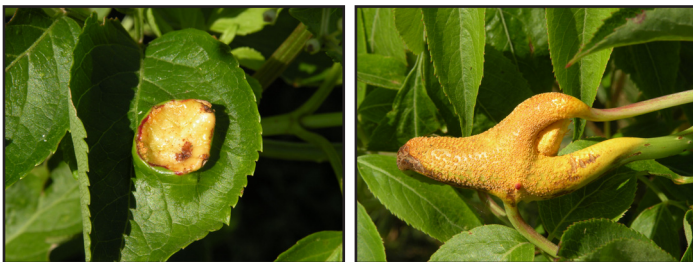
Figure 12: Elderberry rust on leaf blade (l) and petiole

An elderberry rust disease identified as Puccinia bolleyana can cause economic damage (Fig. 12). In minor infections, galls should be pruned out and destroyed; more aggressive control measures may be necessary in severe cases. Sedges are the alternate host of this fungus; however, it is unknown if destroying sedges in the vicinity of elderberry plantings may be helpful.