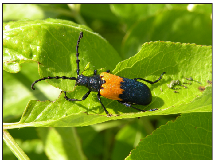
Figure 10: Elderberry longhorn beetle adult

Elderberry longhorn beetles, also known as elder borers ( Desmocerus palliatus ), feed on foliage and flowers as adults (Fig. 10) and bore into the stems and roots as larvae. This boring may cause weakness, breakage or death of stems. These beetles are often present in elderberry orchards in early summer, but not usually in economically significant numbers. Hand removal of the adults may be an effective control measure in small plantings. Economic threshold numbers are unknown for elder borer; however, commercial producers should carefully monitor populations and be prepared to control them if damage is significant.