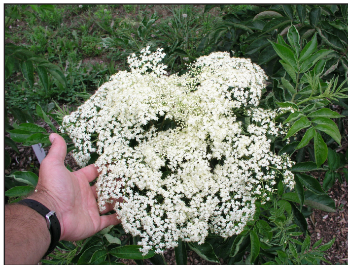
Figure 13: Harvest elderberry blossoms when all flowers are open

Elderberry blossoming takes place in June in Missouri, and flowering cymes harvested for fresh use or drying are clipped when all flowers are open (Fig. 13). Individual flowers are easily removed from the cyme by rubbing over screens. The flowers may then be dried or frozen for future use.