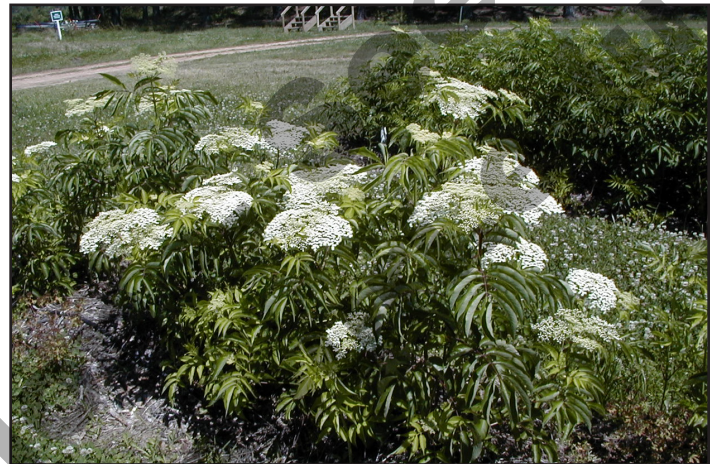
Figure 2: The blossoms of the American elderberry

is commonly found growing in a range of habitats throughout Missouri, but it prefers moist, well-drained, sunny sites and is often found along roadside ditches and streams. Elderberry is a beautiful plant with showy flat cymes of white flowers in June followed by bright purple to black berries in late summer (Figures 2 and 3). Ornamental forms are important landscape plants, and elderberry has been grown for generations as a backyard fruit. Based on identified market size and demand, opportunities exist to increase both the production and processing of elderberry across the value chain. At present, usage of both fruit and flowers for wine, juice, jelly, colorant and dietary supplement