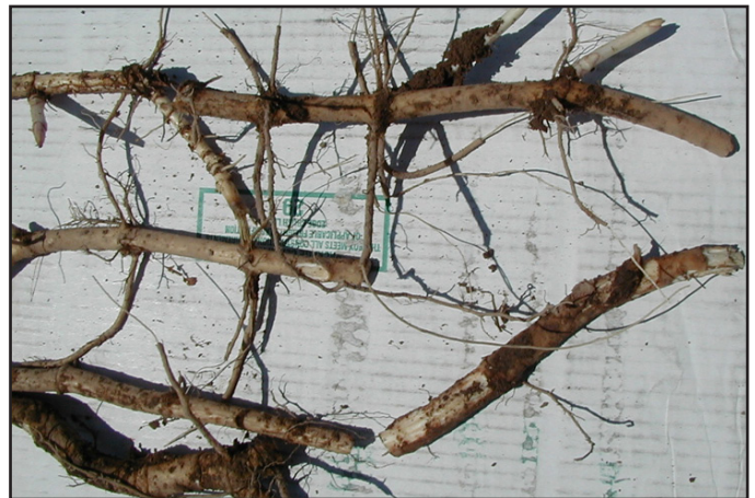
Figure 6: Elderberry root cuttings

begins (Fig. 6). The root cuttings are placed horizontally in a flat or pot, covered with \frac{3}{4} to 1 inch of a light soil or soilless medium and kept warm and moist. Often, a single root cutting will produce 2-3 plants.