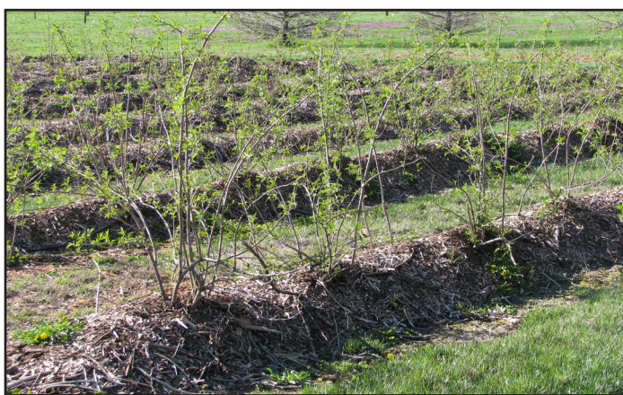
Figure 4: A bermed elderberry planting

As might be expected from a species with wide distribution, elderberry thrives on a range of soils. However, soils that are moderately fertile and with adequate surface and internal water drainage are best for commercial production. To increase success when planting on soils with drainage issues, it is recommended that planting rows be formed into “berms” (raised ridges) prior to planting (Fig. 4). Pre-plant soil testing is recommended to evaluate the soil pH and nutrient levels. Adjust pH level to 5.5-6.5, phosphorus level to 50 lbs/acre, and potassium level to 200-300 lbs/acre. Although elderberry tolerates cold temperatures following bud break, it is best to select sites that are elevated relative to surrounding land to reduce the risk of damage from spring frost. Elderberry requires full sun for optimum production. Control problem perennial weeds such as bermuda grass, johnson grass, blackberry and poison ivy before planting elderberry. Establish a non-competitive ground cover in the alleys between rows to facilitate operations in the planting. Elderberry is a freestanding bush and does not need trellising.