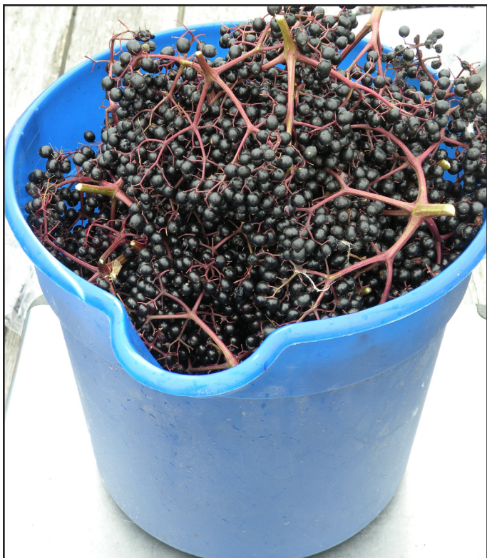
Figure 14: Elderberry fruit are harvested when all berries in the cyme are fully colored

of mixed age will ripen over a 3 to 4 week period. Harvest plants at weekly intervals. Harvest early in the day for best fruit quality. CAUTION: Be careful when picking elderberries from the wild, as the railroad and road crews often spray just before they are ready for harvest. Yields may range from 2 to 4 tons per acre for mature bearing plantings, though higher yields have been recorded. Harvested fruit is highly perishable; refrigerate at 32-40°F as soon as possible after harvest. Fresh individual berries are difficult to separate from the cyme without tearing and loss of juice. Whole cymes may be frozen, and individual berries separated from the stems by hand shattering or by placing the frozen cymes in a fruit de-stemmer. Berries may be stored frozen for a few months before processing; however, research has shown that the health-giving anthocyanins (purple pigments) in elderberry are fragile and easily destroyed by long-term storage, repeated freezing and thawing cycles, and over-processing, resulting in brown fruit (and brown products) with reduced health benefits.