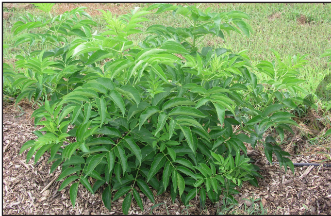
Figure 1: The American Elderberry plant

The American elderberry ( Sambucus canadensis , also known as Sambucus nigra subsp. canadensis ) is native to much of eastern and midwestern North America. The plant is a medium to large multiple-stemmed shrub, bush or small tree (Fig. 1). Elderberry