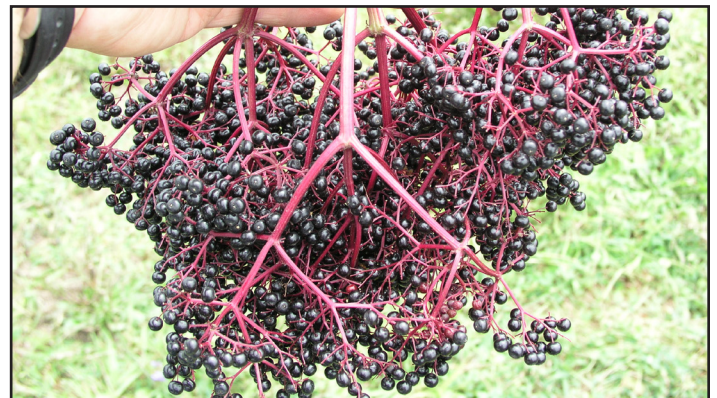
Figure 3: The fruit of the American elderberry

products is on the rise. European elderberry ( Sambucus nigra ) is grown as a commercial fruit crop in Europe and elsewhere. The American elderberry, however, appears to be a better candidate for commercial production in Missouri. This guide outlines production practices and market information for American elderberry based on research and growers' experiences in Missouri.