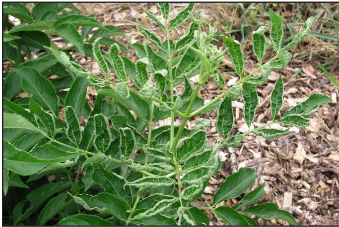
Figure 7: Foliar injury from eriophyid mite

Eriophyid mites are microscopic pests that cause cupping and crinkling of the foliage (Fig. 7) and can destroy florets and young fruit in severe infestations. Little is currently known about this pest, including its species, life cycle, and how best to control or manage it. Eriophyid mites are believed to overwinter under buds and bud scales on above-ground portions of the plant and are therefore easily and unknowingly spread by transporting dormant cuttings for propagation.