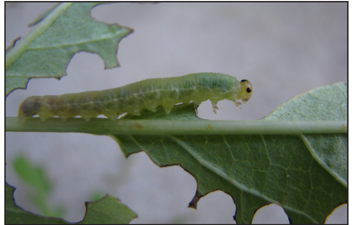
Figure 9: The larva of the elderberry sawfly

The larvae of the elderberry sawfly ( Tenthredo grandis ) can quickly defoliate elderberry plants in late spring (Fig. 9). While they tend to leave developing flowers undisturbed, they can also damage flowers in severe cases. Producers must understand that this pest is not a true caterpillar; therefore, certain common control measures for moth and butterfly caterpillars are ineffective against it.