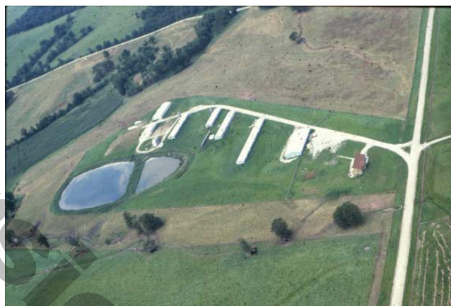
Figure 1. A livestock feeding operation site should be selected to minimize visual contact with neighbors and traffic and to separate odor-producing facilities from neighbors.

Odors are inherent in livestock operations, especially when manure is being applied to the land. The larger the livestock operation, the more important it is to plan, design, construct and operate the facility in a manner that will minimize off-site (and on-site) odors. It is important to control sufficient land to provide an adequate buffer between neighbors and the more odor-