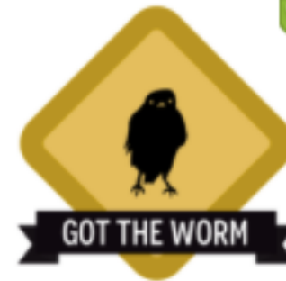
Got the Worm