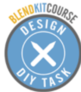
BlendKit2015: D... University of Centr...