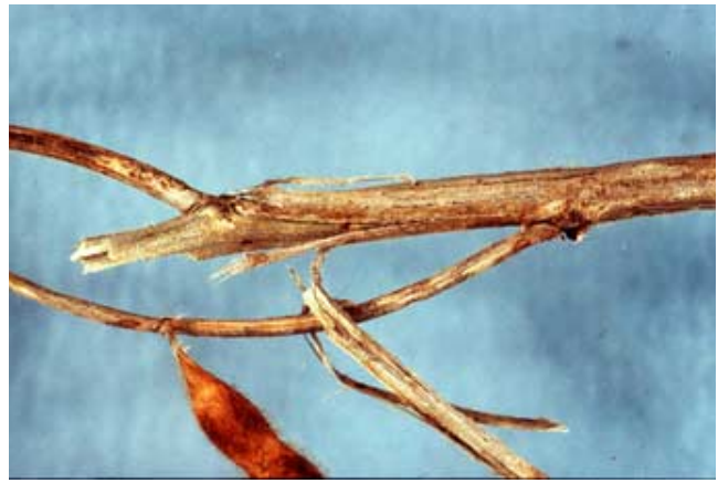
Figure 3. In late summer, a light gray or silvery discoloration may be seen on lower stems of soybean plants damaged by charcoal rot, and the tissue beneath the bark may appear grayish black.

Symptoms: This fungus produces a variety of symptoms on soybeans, including death of seedlings just before or after emergence and lower stem rot. The fungus produces a white, cottony growth over the