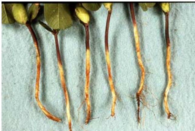
Figure 1. Lesions on soybean seedling roots are a symptom of seedling disease.

Symptoms: Dark brown or reddish lesions on the